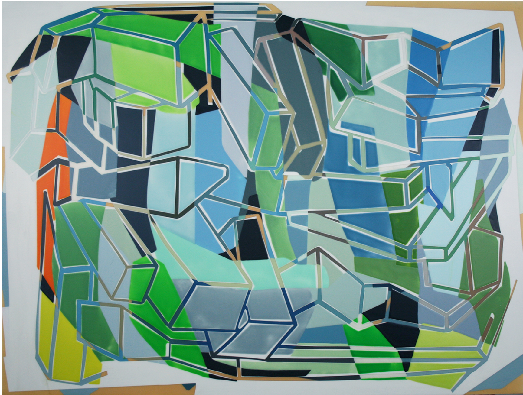
Susan Dory, Outgrowth , 2019, Acrylic on Canvas over Panel, 30.25 x 40 inches