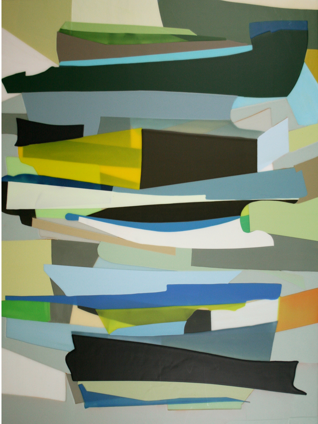
Susan Dory Amassment 2 2019 Acrylic on Canvas over Panel 40 x 30.25 inches