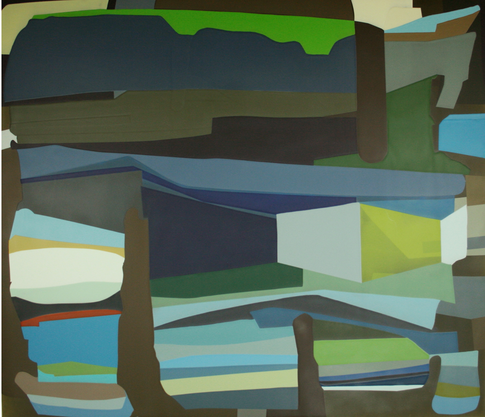
Susan Dory Exotic Mass 2019 Acrylic on Canvas over Panel 52 x 60 inches