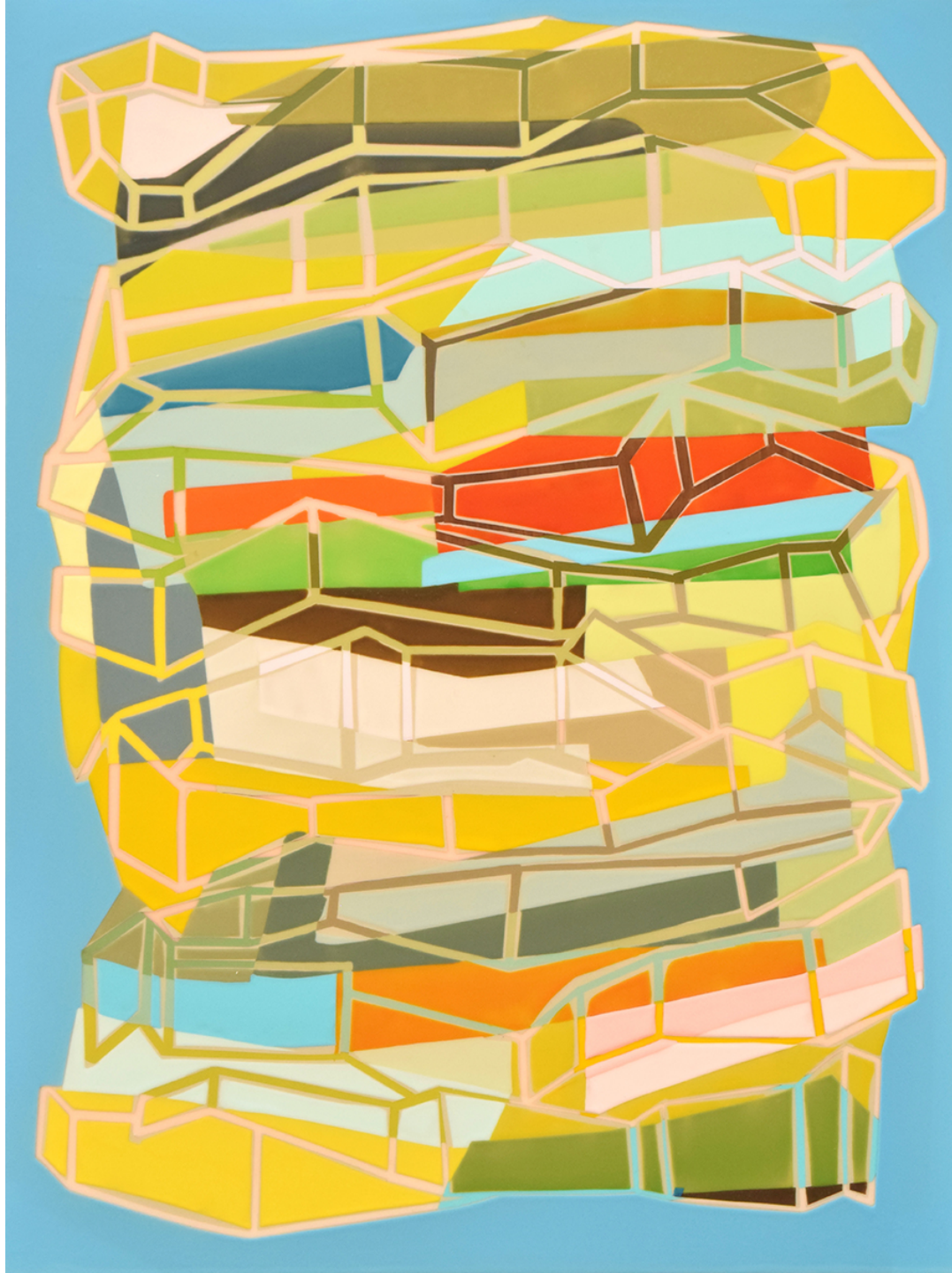
Susan Dory Twin Rink 2 2019 Acrylic on canvas over panel 40 x 30 inches