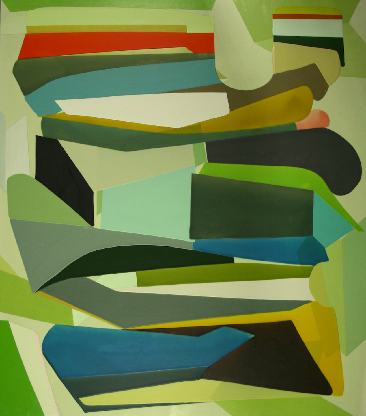
Susan Dory Knob and Kettle 2019 Acrylic on canvas over panel 50 x 44 inches