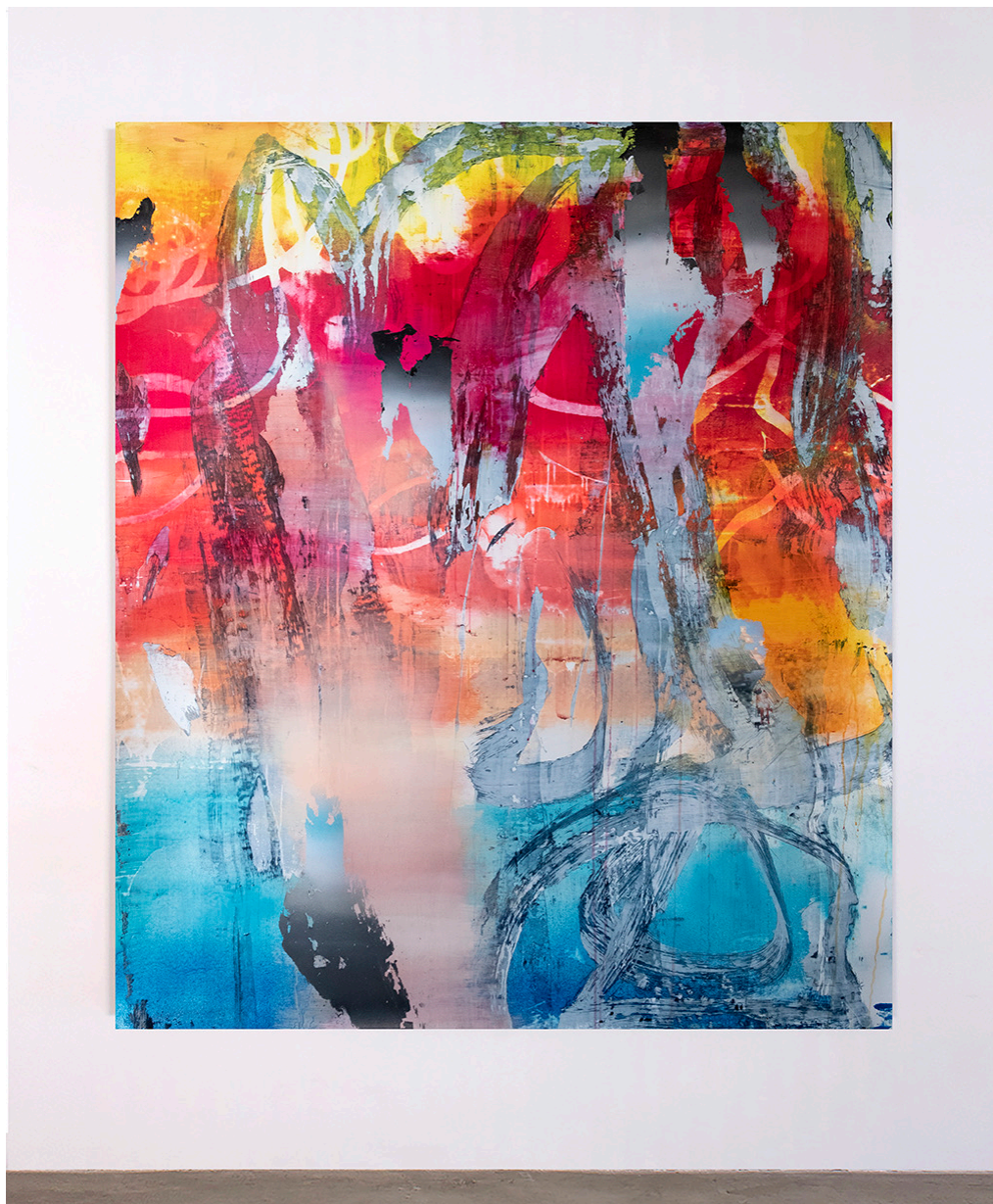
TZS, 2021, Acrylic and acrylic spray paint on yupo mounted to sintra, 68 x 60 inches, $13,000