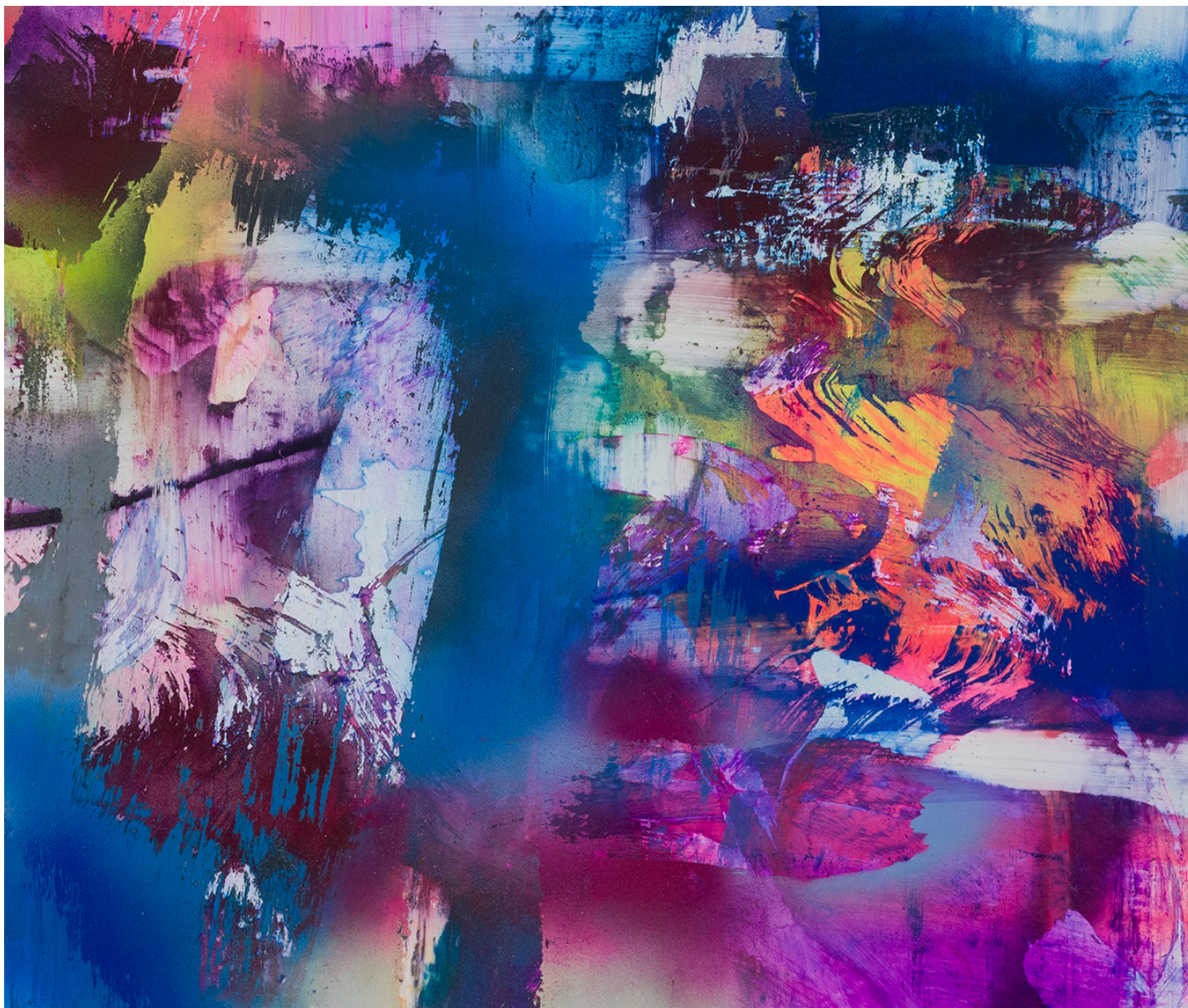
Detail view of MACD