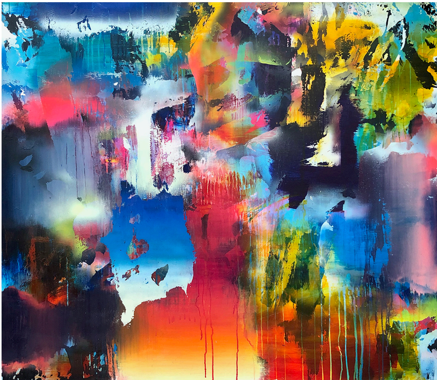
LAF, 2021, Acrylic and acrylic spray paint on yupo mounted to sintra, 59 x 53 inches, $10,000