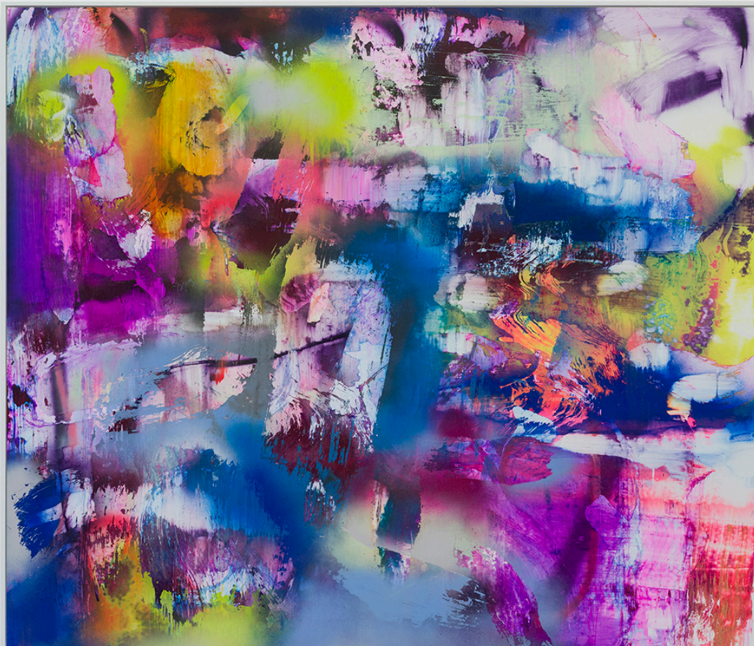
MACD, 2021, Acrylic and acrylic spray paint on yupo mounted on sintra, 60.5 x 51.5 inches, $10,500