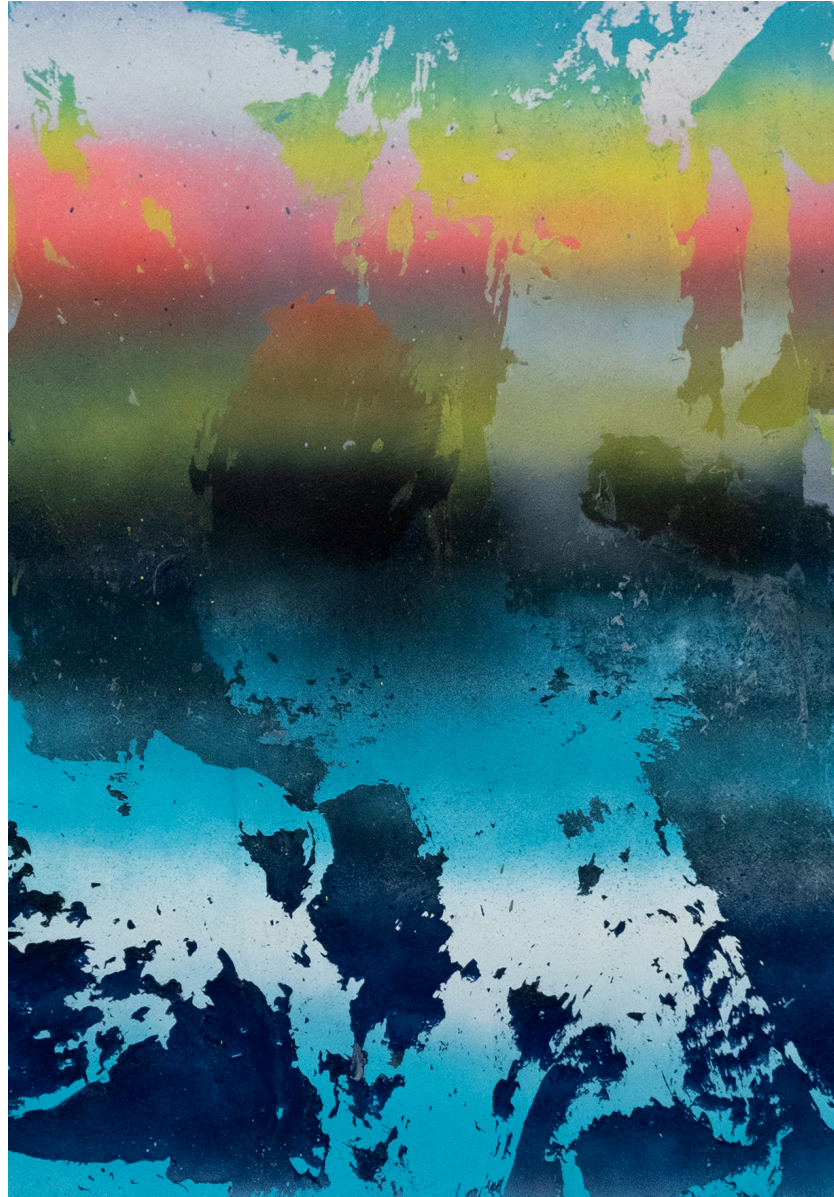
Detail view of BNV