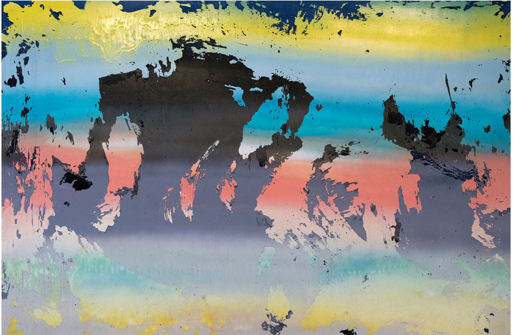
MRGE, 2021, Acrylic and acrylic spray paint on yupo, 25.5 x 39 inches, $4,500