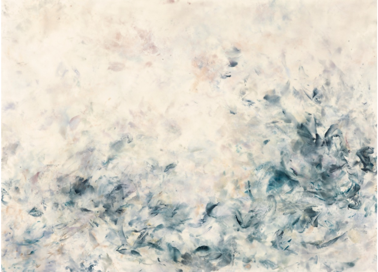
Mouth of Fountains Open 2023

Hot wax, cold wax, and oil on panel 48 x 66 inches $25,000