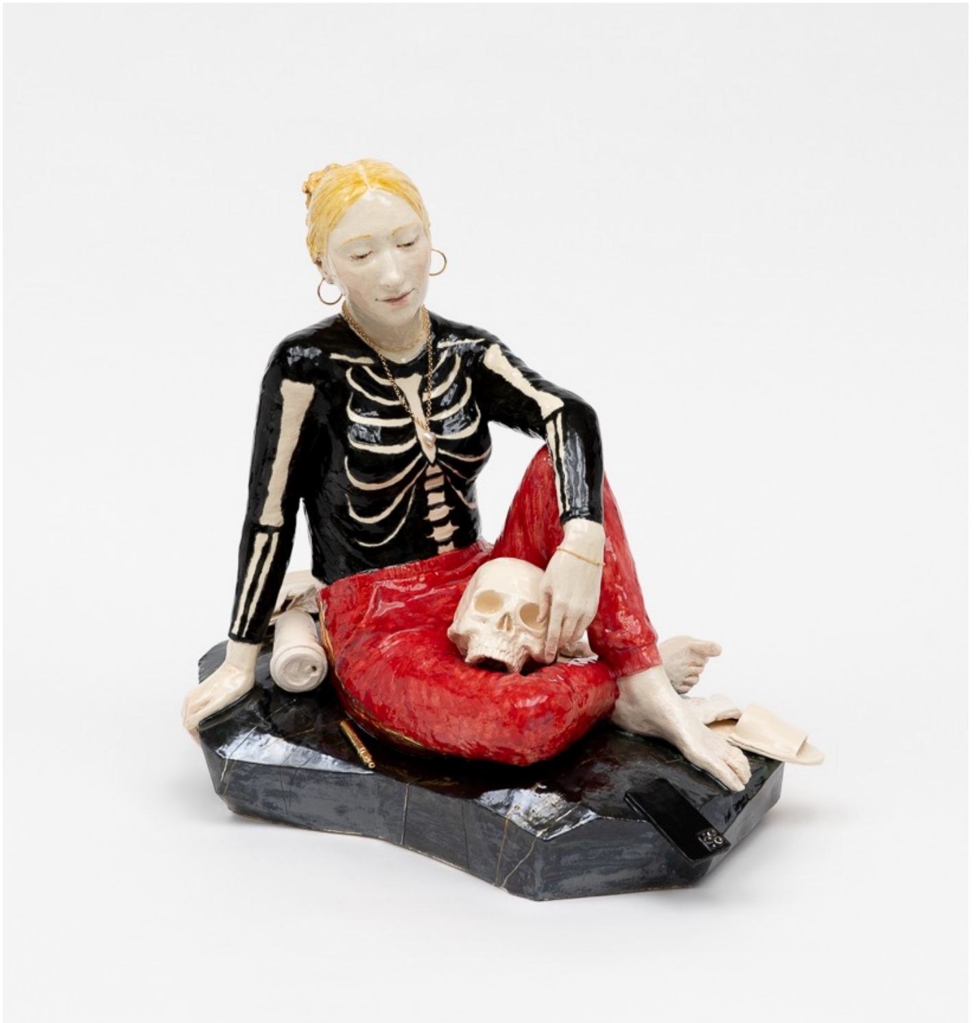
Artist: Claire Partington Title: Death and the Maiden Year: 2024 Medium: Ceramic and mixed media Size: 18 x 20 x 12 inches Price: $18,500