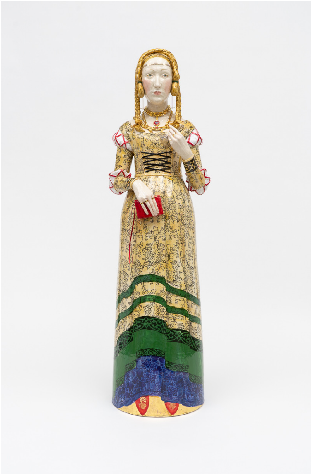
Artist: Claire Partington Title: Valentine 2 Year: 2022 Medium: Earthenware and mixed media Size: 36 x 10 x 9 inches Price: $19,500