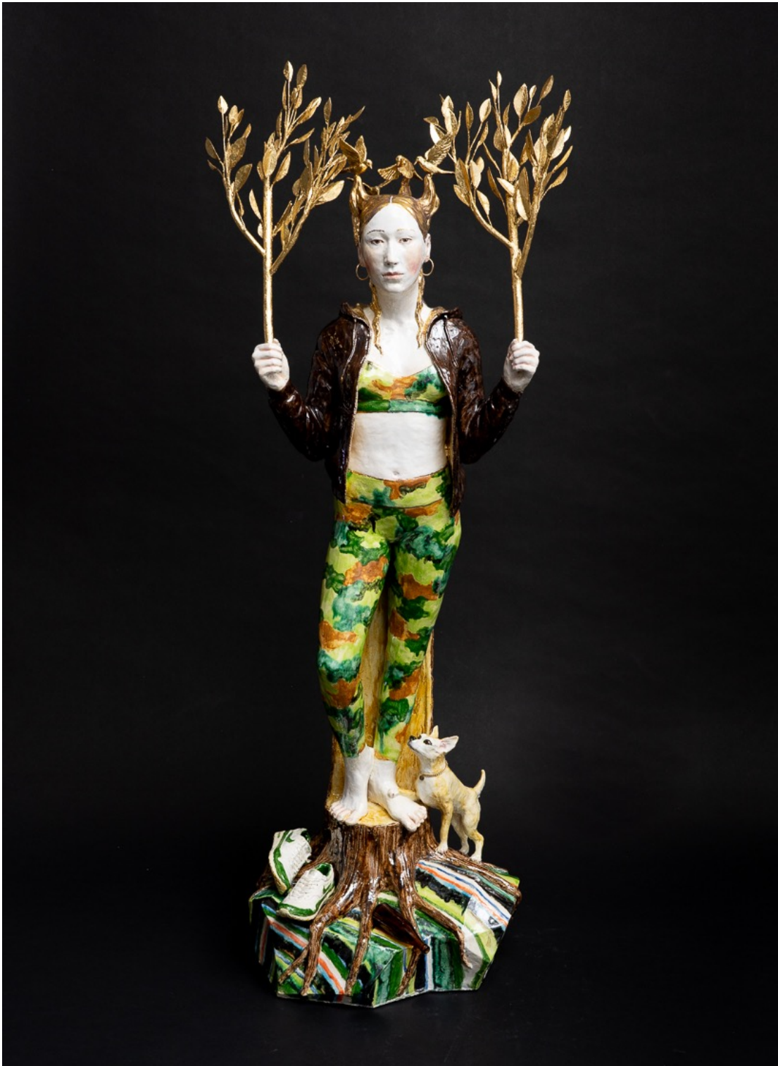
Artist: Claire Partington Title: Daphne Year: 2024 Medium: Ceramic and mixed media Size: 40 x 12 x 12 inches SOLD