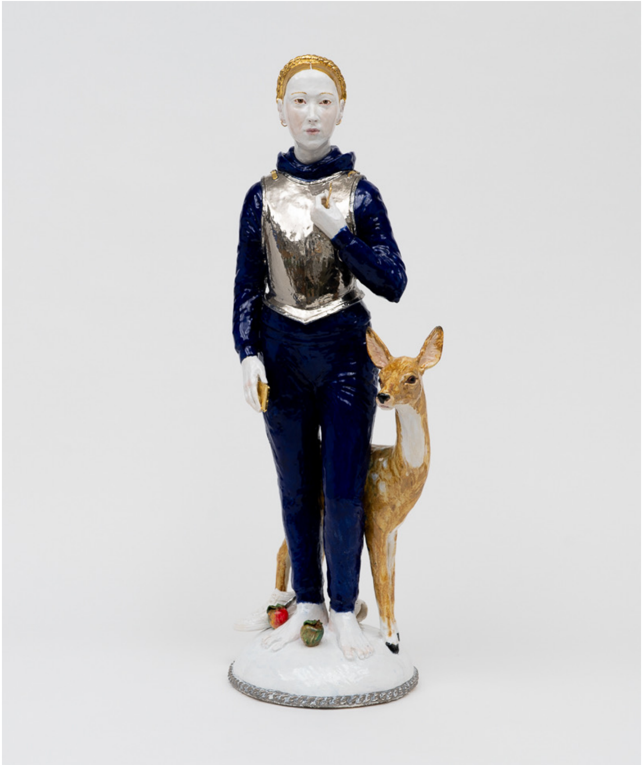
Artist: Claire Partington Title: Hart (Blue) Year: 2024 Medium: Ceramic and mixed media Size: 31 x 12 x 11 inches Price: $18,500