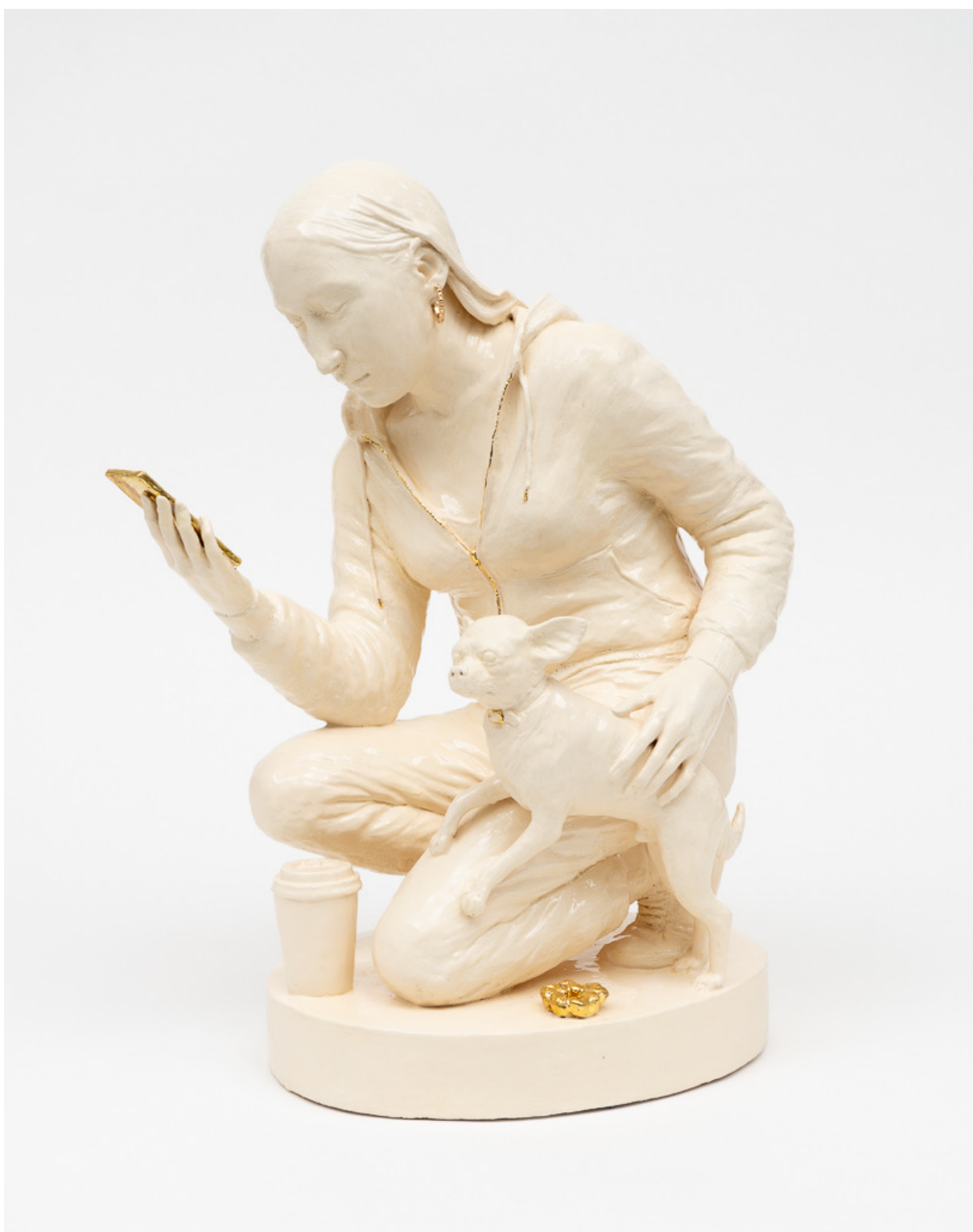
Artist: Claire Partington Title: Crouching Venus Year: 2024 Medium: Ceramic and mixed media Size: 19 x 16 x 9 inches SOLD