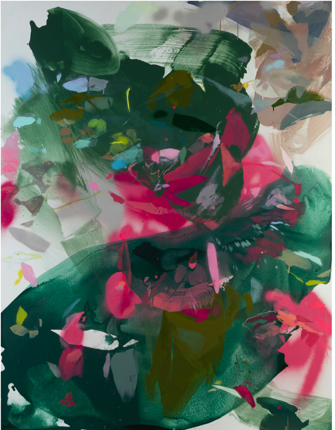
Emily Leonard: Camellia in Flight, 2024, Oil on Panel, 60 in x 46 in x 3.25 in, $17000.00