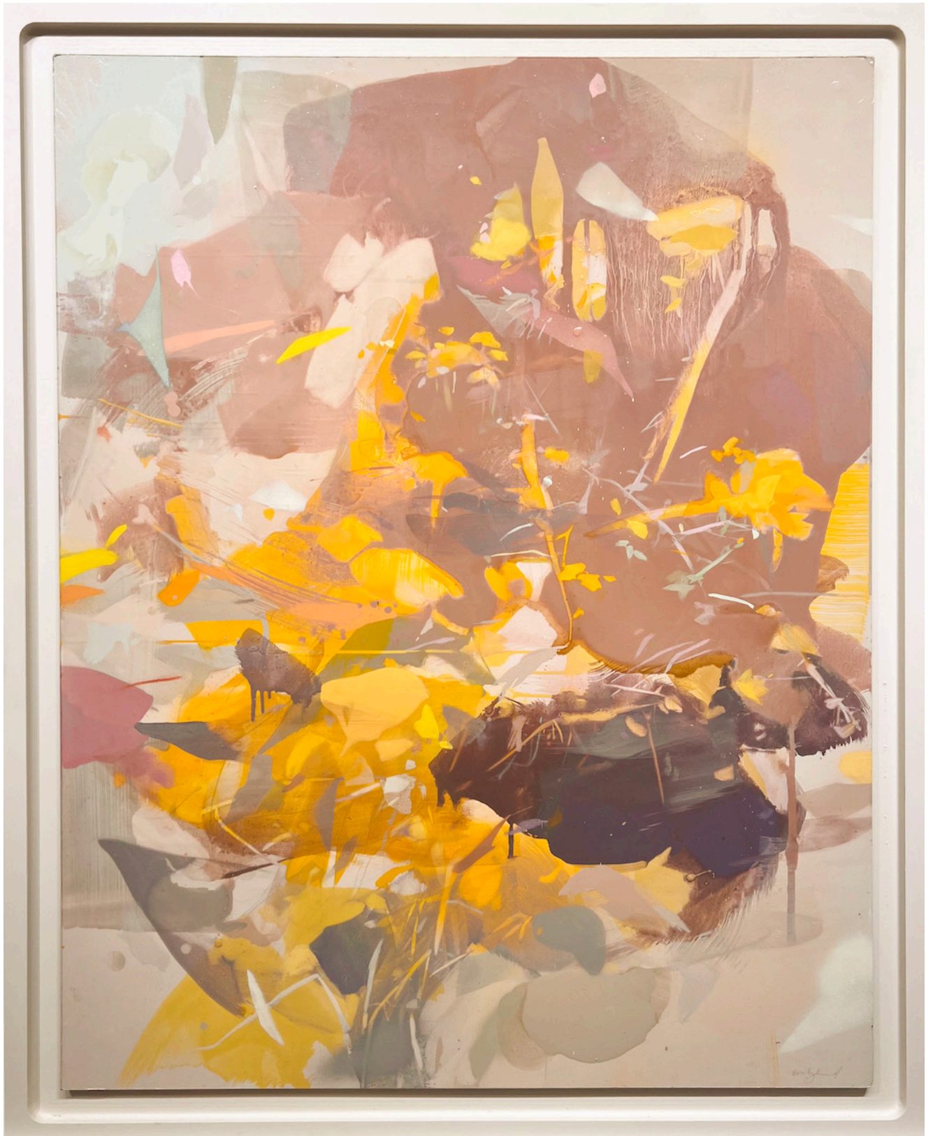
Emily Leonard: Chamisa Against Adobe, 2024, Oil on panel, 45.5 in x 36.5 in x 0.3 in (Framed: 50.5 x 41.5 x 1 inches), $13000.00