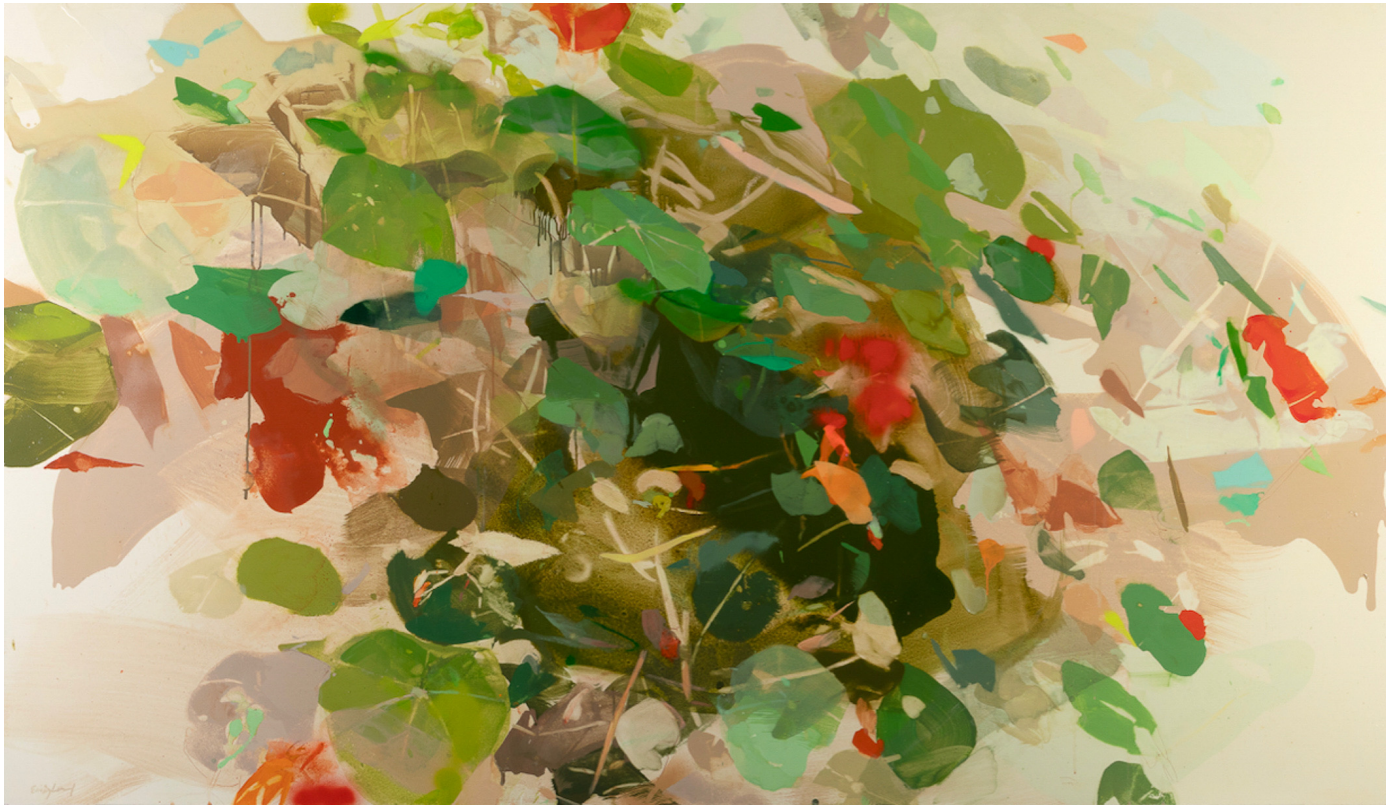
Emily Leonard: Sow (Nasturtiums), 2023, Oil on Panel, 48 in x 84 in x 3.25 in, $21500.00