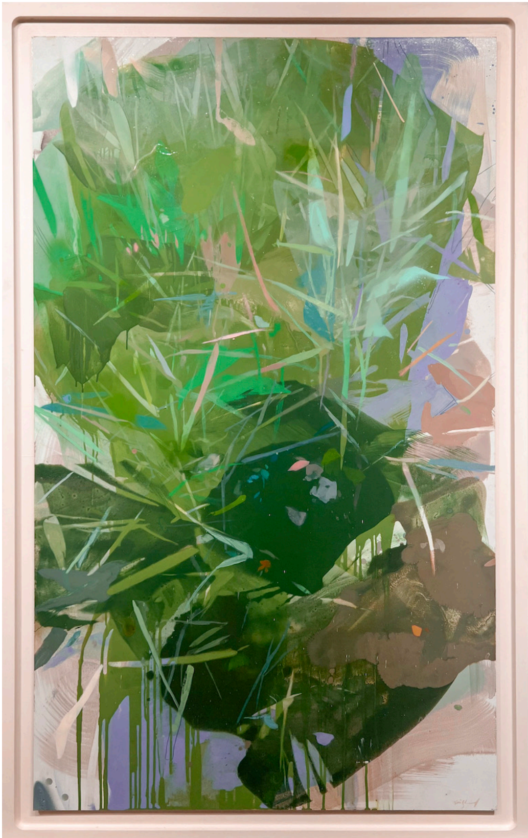
Emily Leonard: July (After Monsoons), 2024, Oil on panel, 60 in x 36 in x 0.02 in (Framed: 65 x 41 x 1 inches), $15000.00