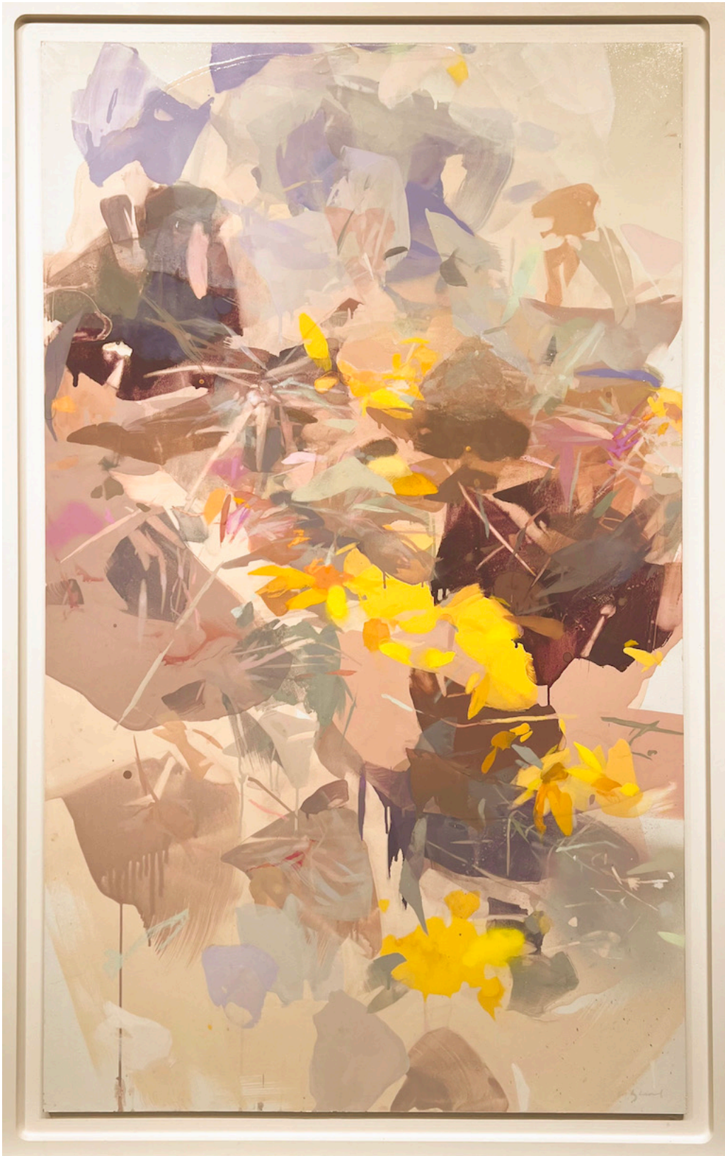
Emily Leonard: May (Apache Plume and Senecio), 2024, Oil on panel, 60 in x 36 in x 0.02 in (Framed: 65 x 41 x 1 inches), $15000.00