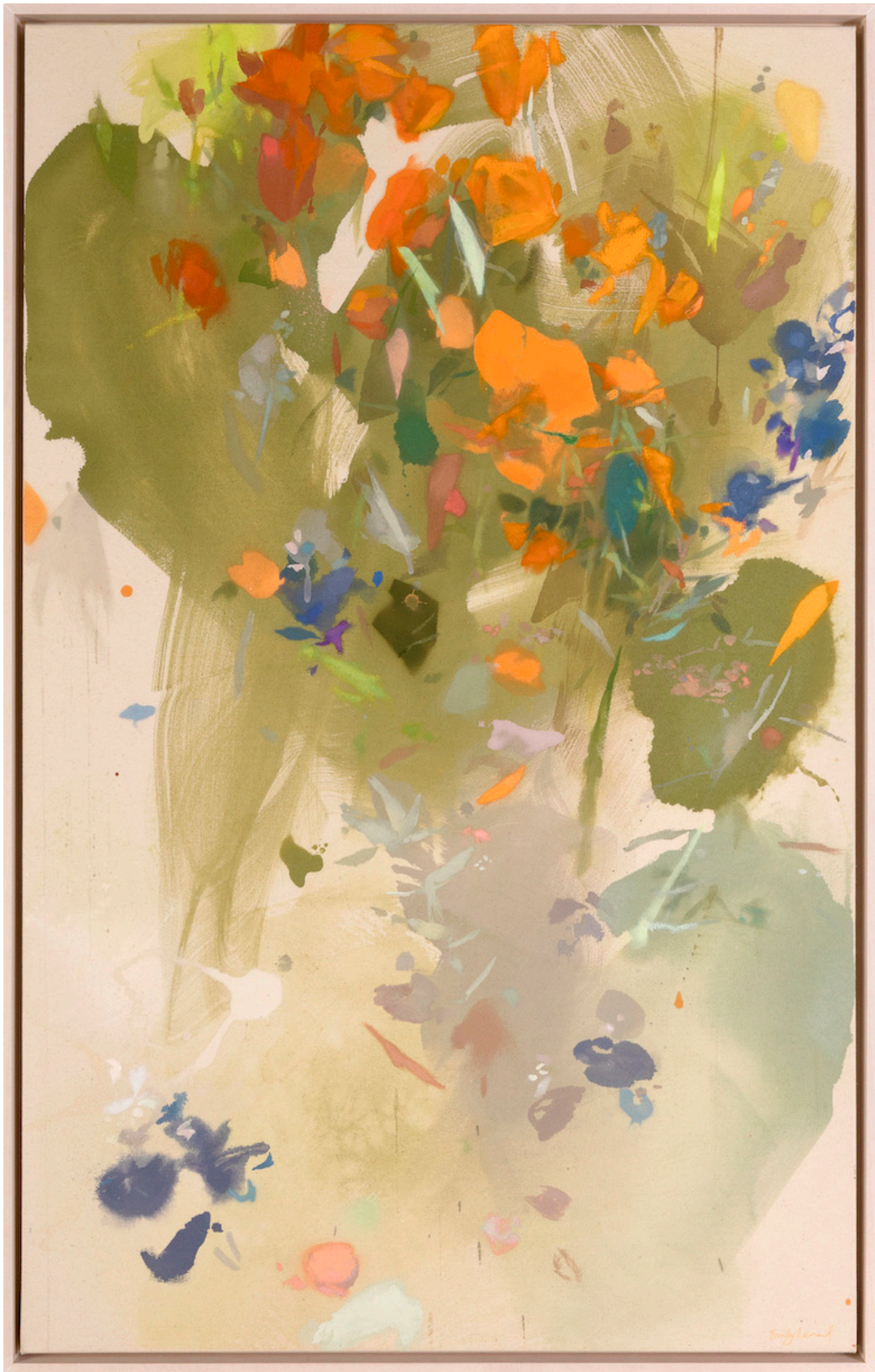
Emily Leonard: April (California Poppies and Lupine), 2024, Oil on Canvas, 47 in x 29.5 in x 1.5 in (Framed: 49.5 x 31.5 x 2 inches), $12000.00