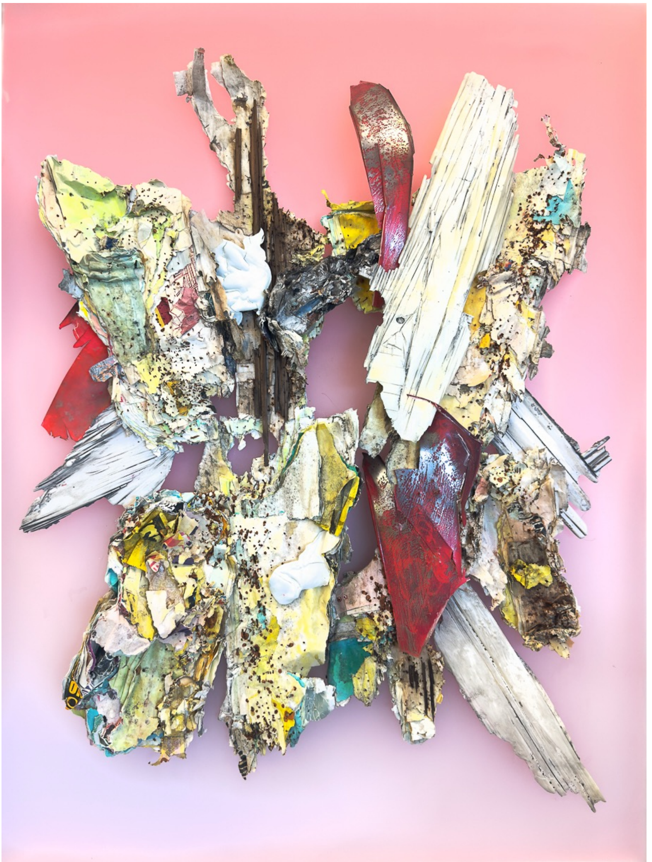
Peter Gronquist, Alchemist VII, 2024, Polyurethane, ink, acrylic, salvaged paper, quartz paint, satin, resin on plexiglass and wood, 48 x 36 inches, $14,500