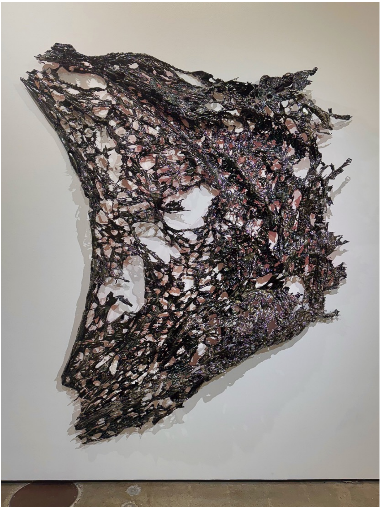
Peter Gronquist, Shroud II , 2024, Satin, resin, fiberglass, enamel, silver nitrate, quartz paint, 95 x 80 inches, $30,000