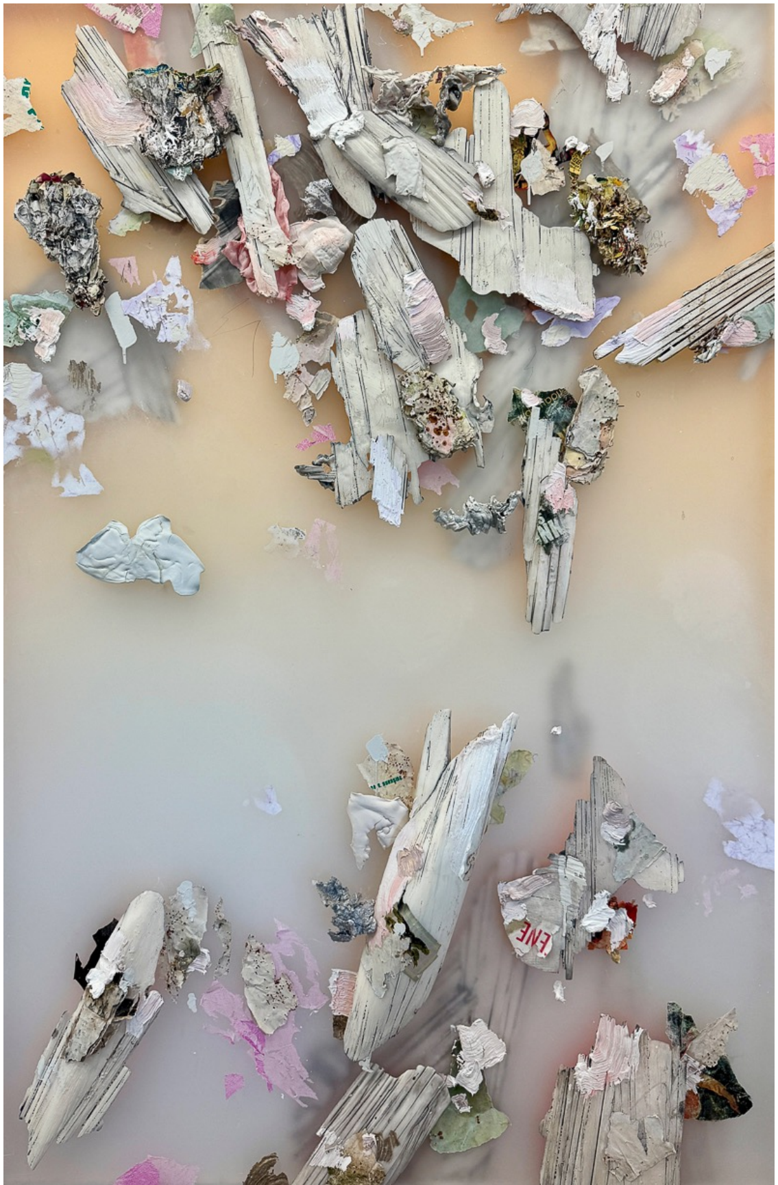
Peter Gronquist, Alchemist II , 2024, Polyurethane, ink, acrylic, salvaged paper, quartz paint, satin, resin on plexiglass and wood, 72 x 48 inches, $22,000