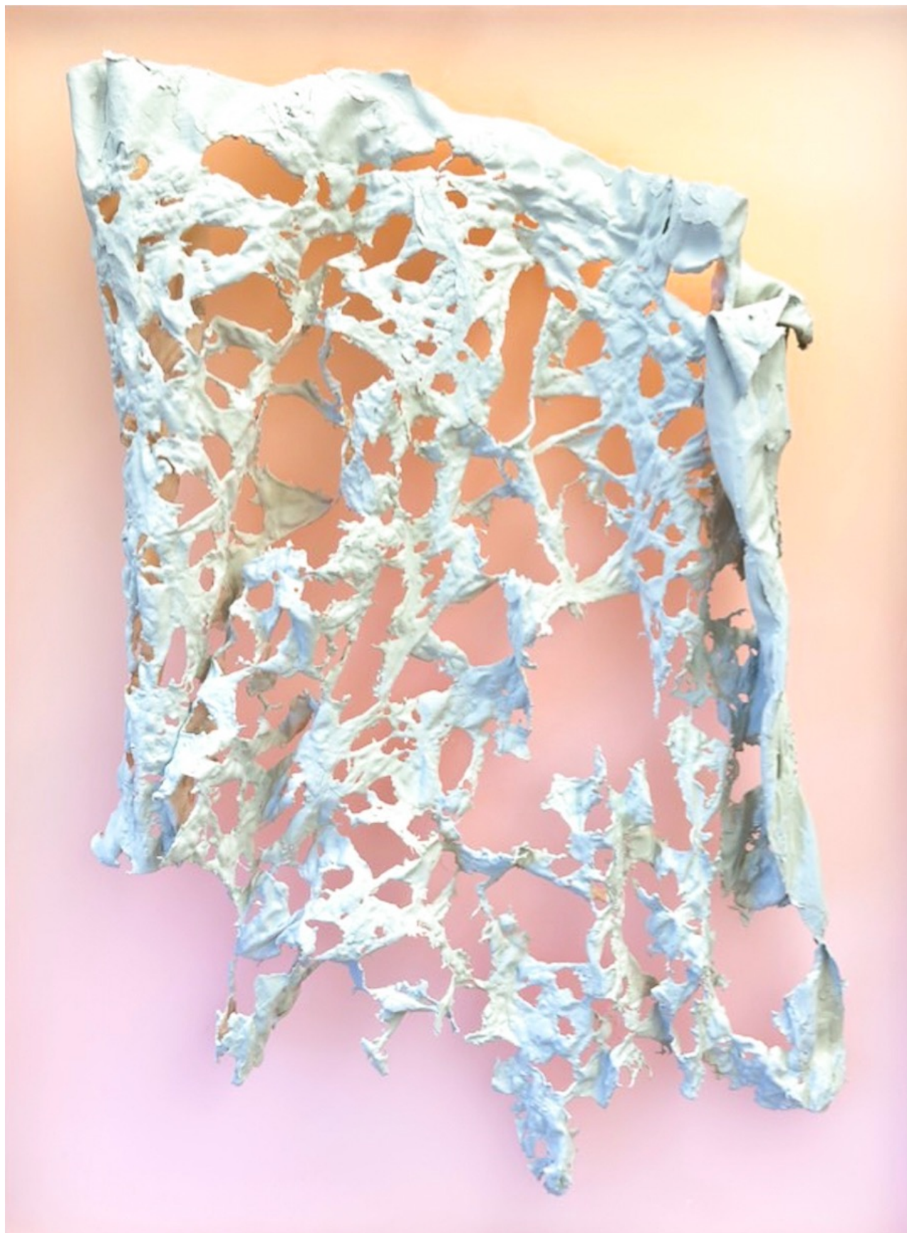
Peter Gronquist, Alchemist V , 2024, Satin, resin, acrylic, quartz paint on plexiglass and wood, 48 x 36 inches, $14,500