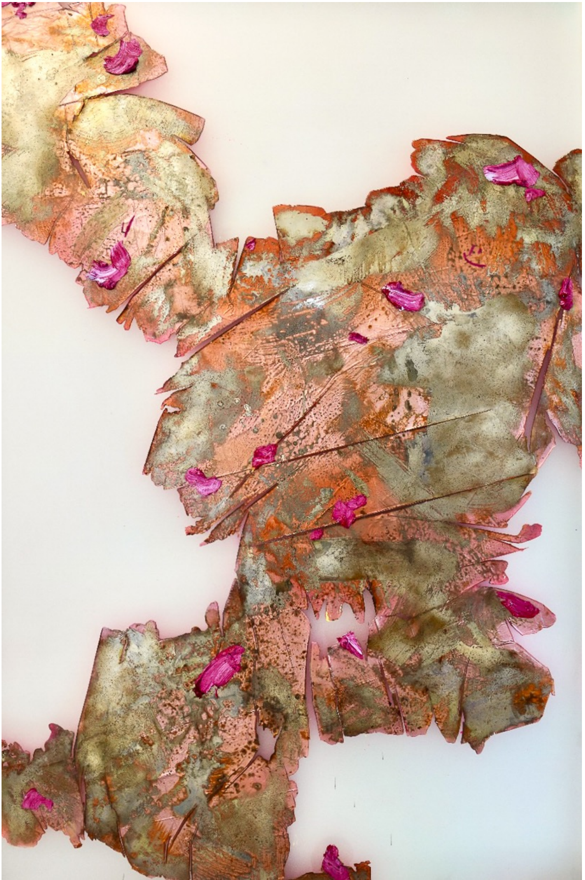
Peter Gronquist, Alchemist VI , 2024, Resin, pigment, silver oxide, acrylic, oil, Vinyl record on plexiglass and wood, 72 x 48 inches, $22,000