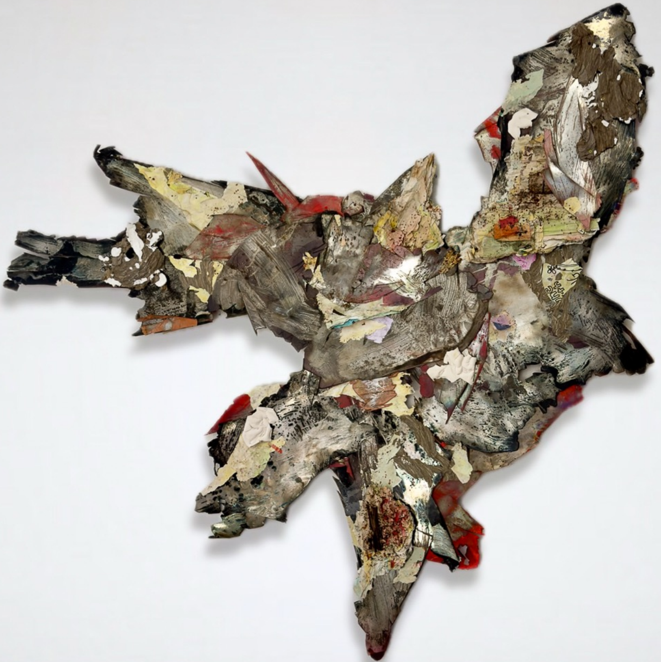
Peter Gronquist, Fragment I , 2024, Resin, pigment, enamel, silver nitrate, wasp paper, squid ink, salvaged paper, oil, quartz paint, graphite, 95 x 80 inches, $34,000