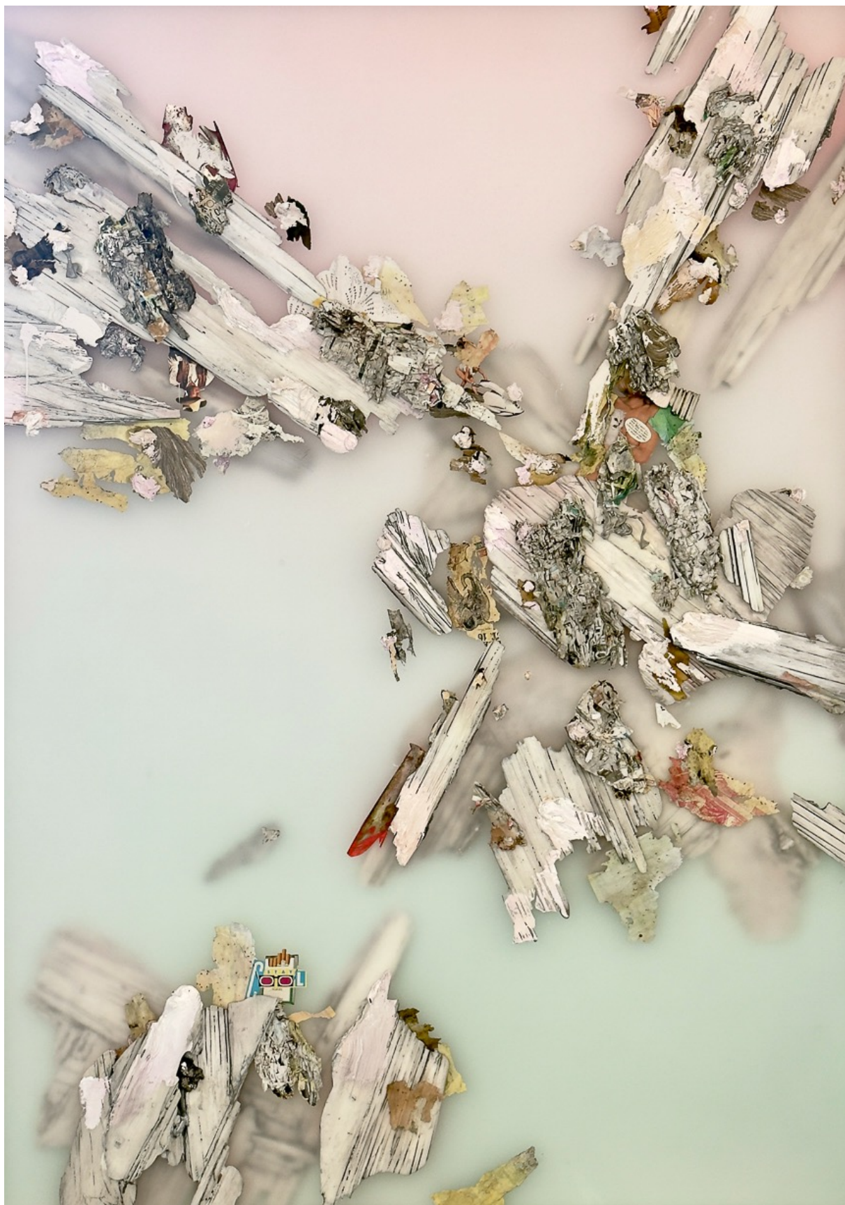
Peter Gronquist, Alchemist IV, 2024, Polyurethane, ink, acrylic, salvaged paper, quartz paint, satin, resin on plexiglass and wood, 84 x 60 inches, SOLD