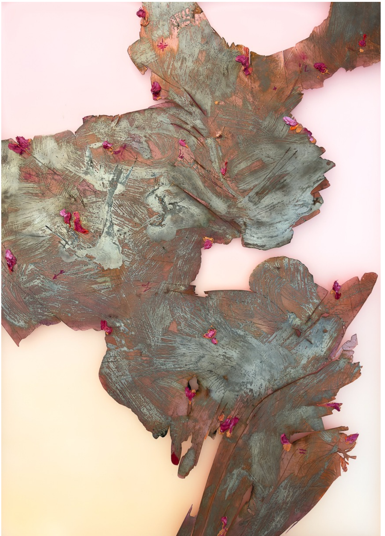
Peter Gronquist, Alchemist 1 , 2024, Resin, pigment, silver oxide, acrylic, oil, Vinyl record, 84 x 60 inches, $25,000