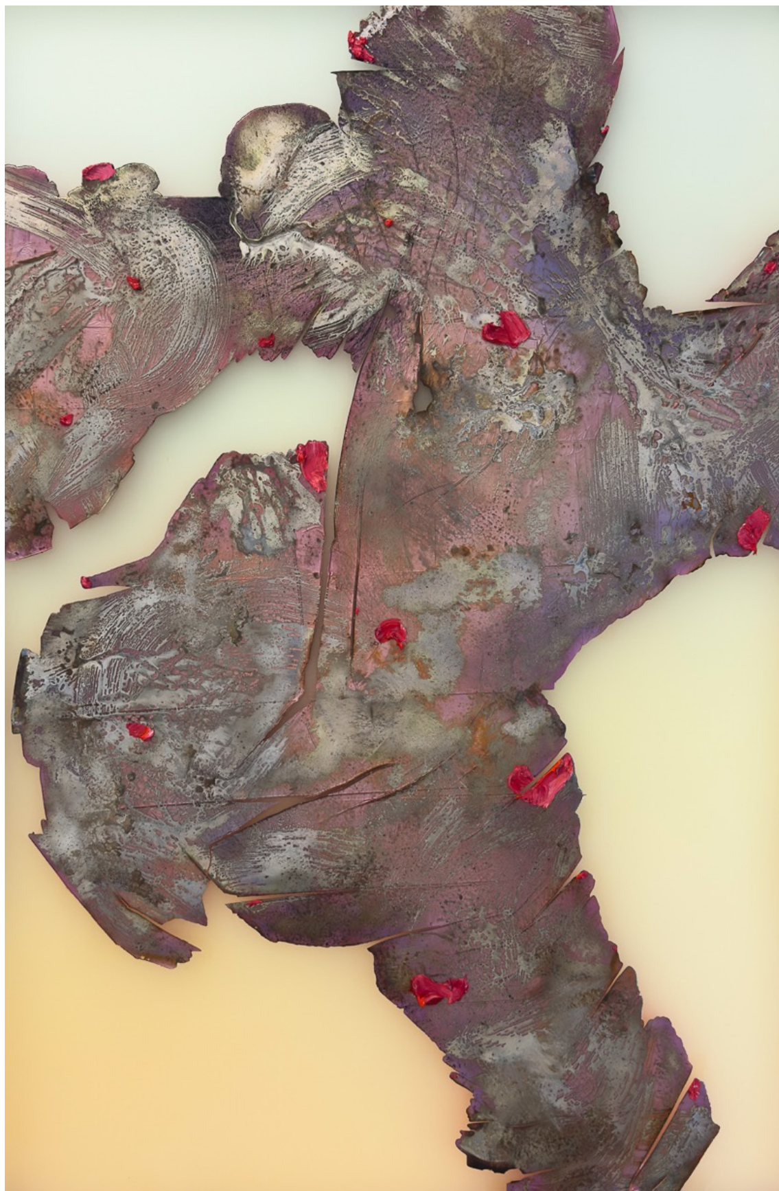
Peter Gronquist, Alchemist III , 2024, Resin, pigment, silver oxide, acrylic, oil, Vinyl, record on plexiglass and wood, 72 x 48 inches, $22,000