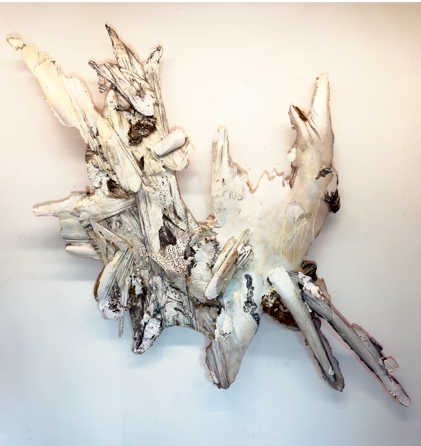
Peter Gronquist, Fragment II, 2024, Polyurethane, oil, acrylic, latex, ink, quartz, paper, wasp paper, ash and steel, 95 x 89 inches, $34,000