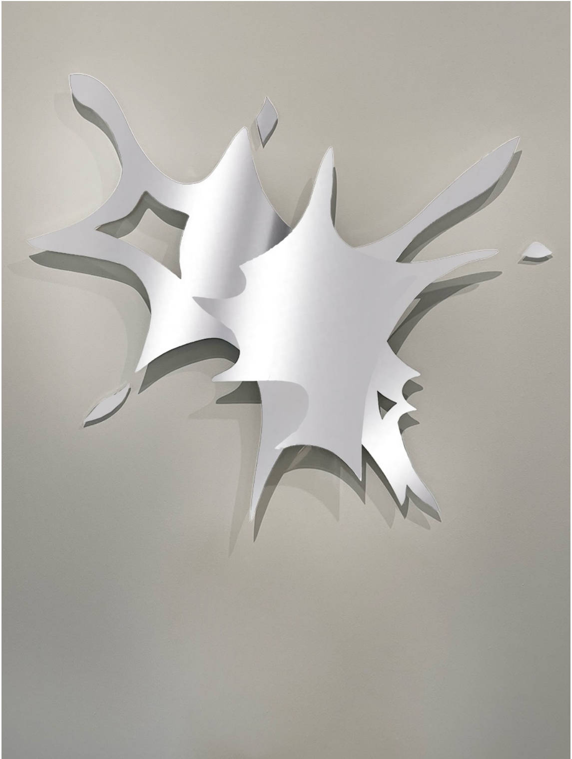
Andreas Kocks, Reading the Air (#2471 V), 2025, Stainless Steel, Polished