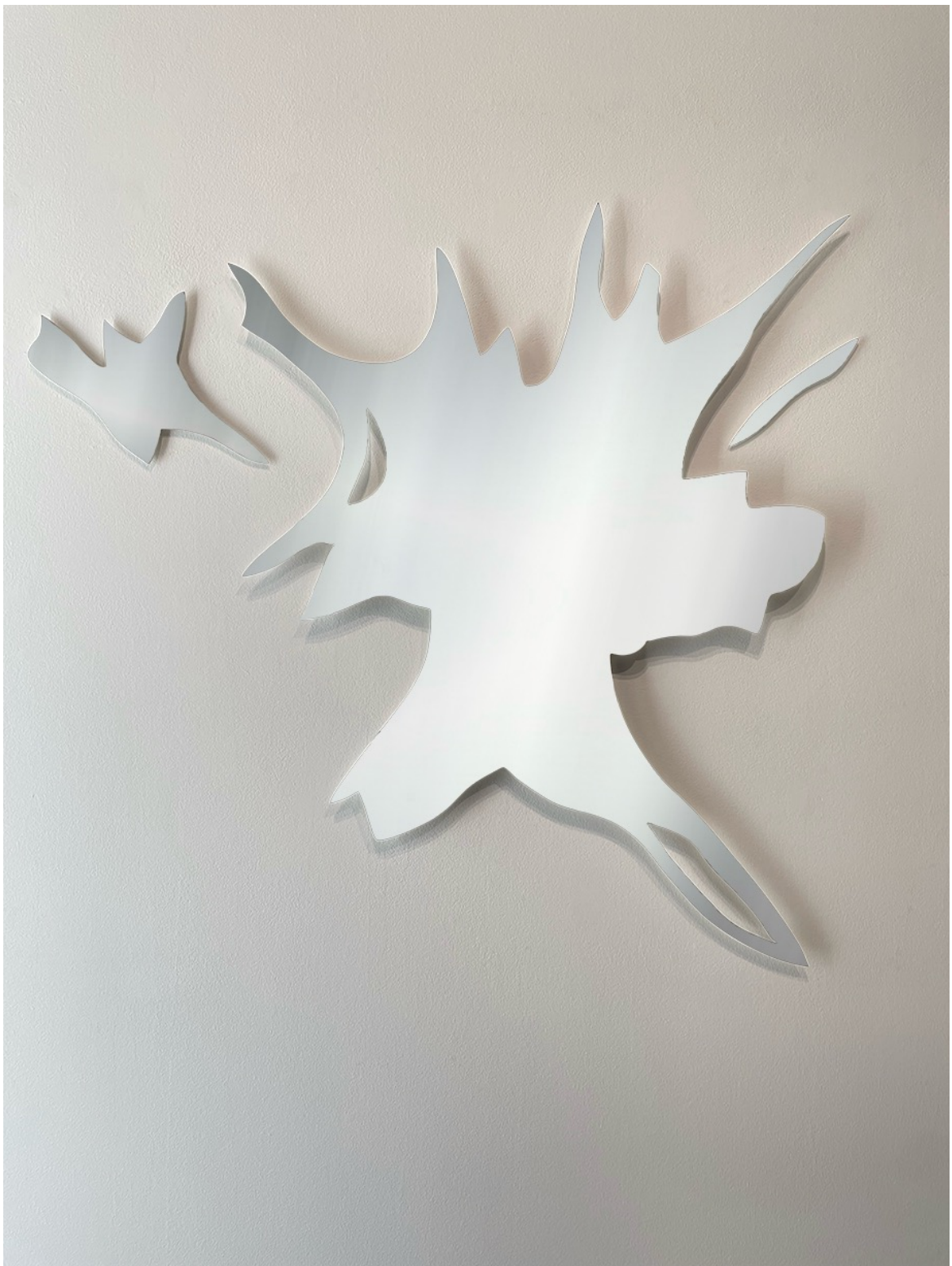
Andreas Kocks, Reading the Air (#2470V), 2025, Stainless Steel, Polished