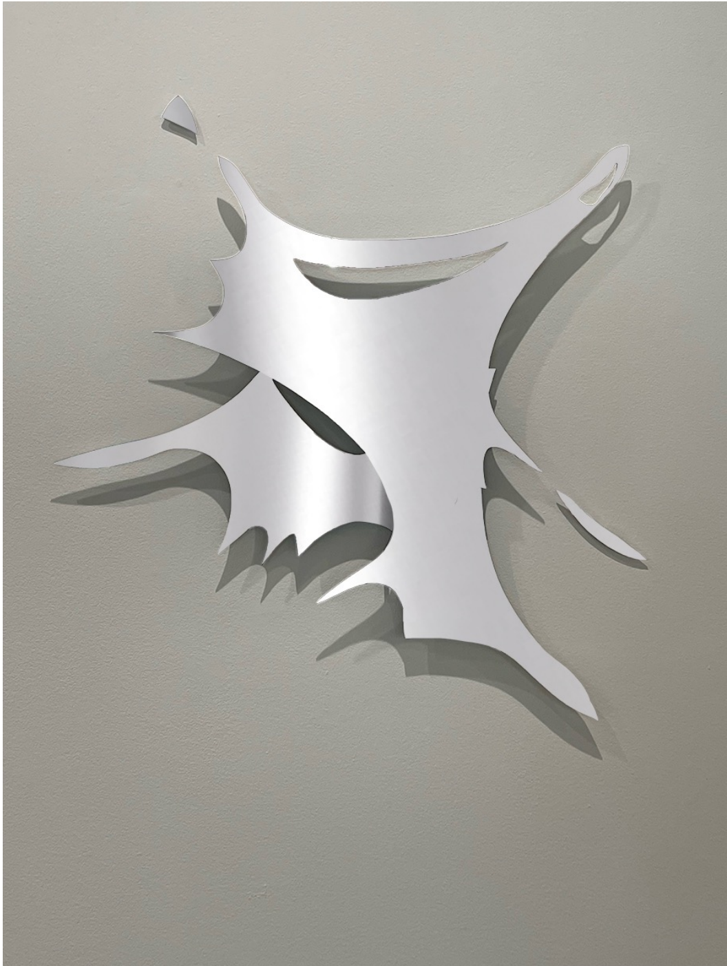
Andreas Kocks, Reading the Air (#2473V), 2025, Stainless Steel, Polished