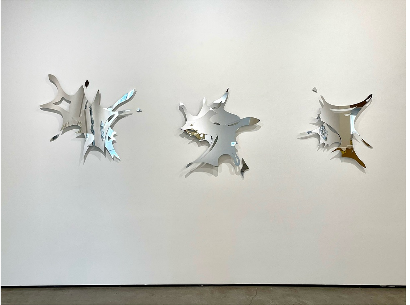
Installation of Andreas Kocks, Reading the Air (#2471, #2472, #2473)