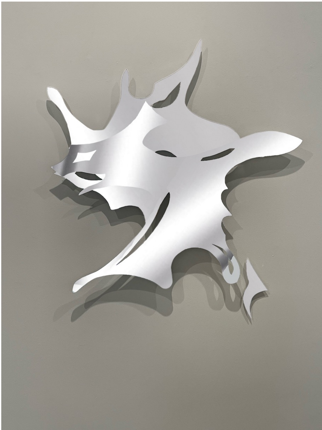
Andreas Kocks, Reading the Air (#2472V), 2025, Stainless Steel, Polished