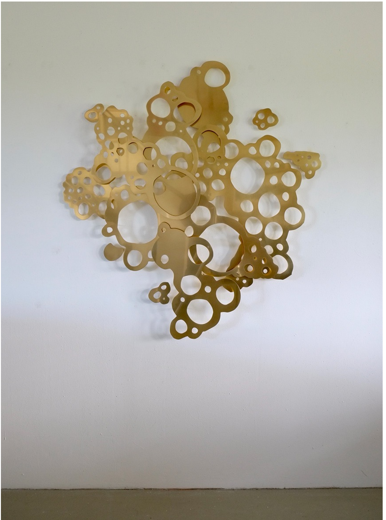
Andreas Kocks, Solid Ether (#2106B), 2021, Coated Brass