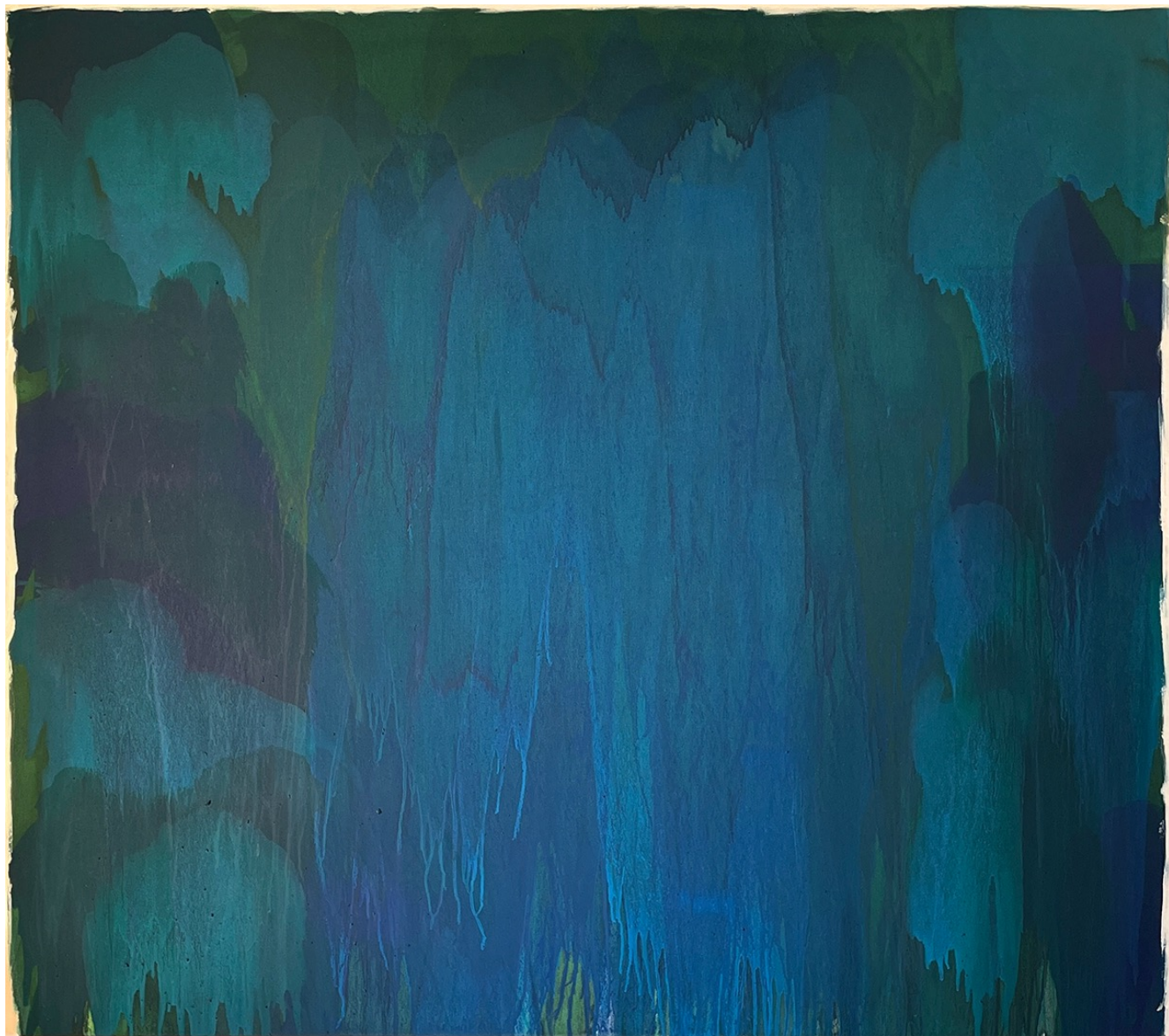
Marcel Rozek, A Welcome Sight , 2025, Oil and latex on canvas, 64 x 72 x 1.5 inches, $13,600