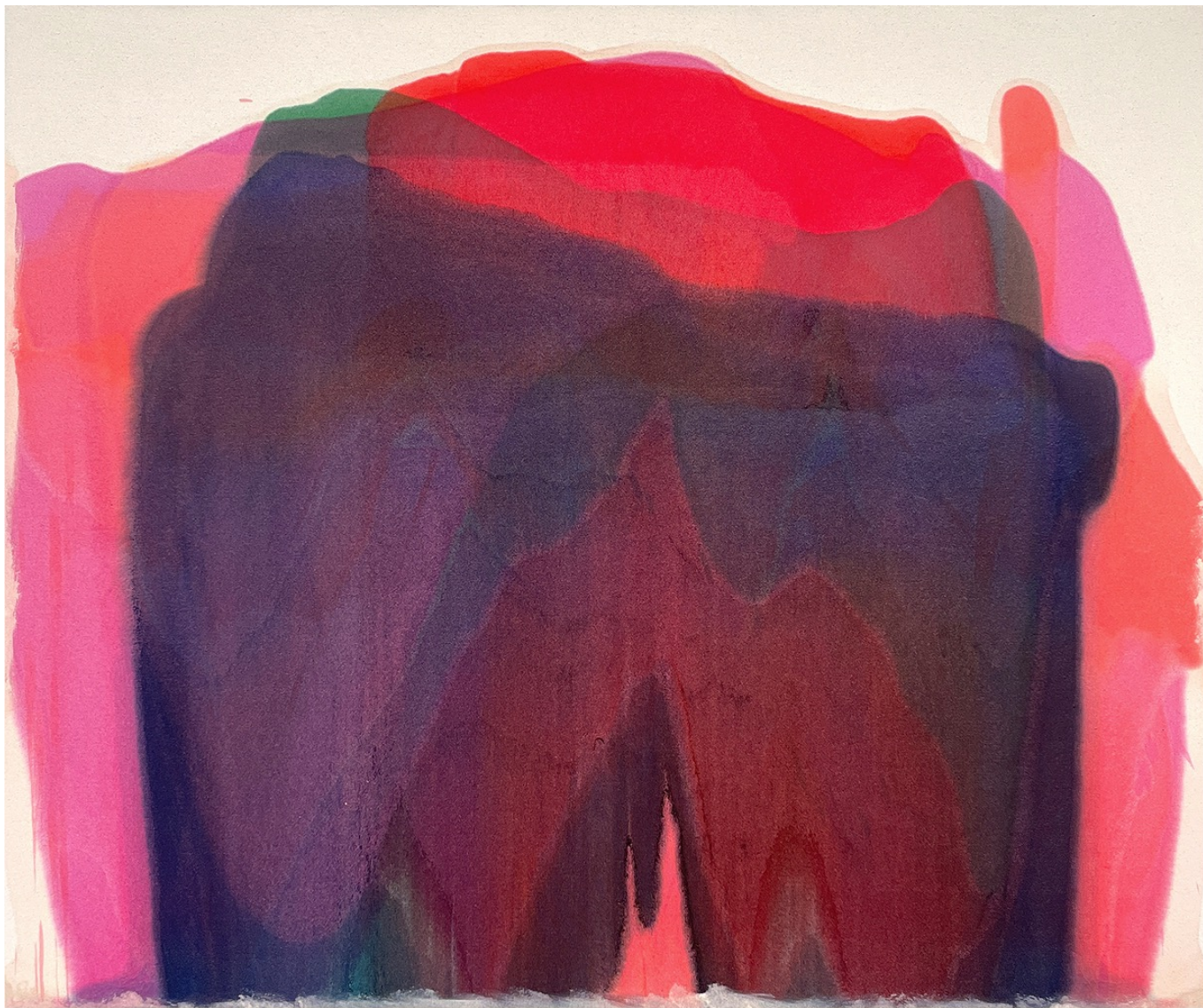
Marcel Rozek, The Day is Done , 2025, Oil and latex on canvas, 40 x 48 x 1.5 inches, $8,800