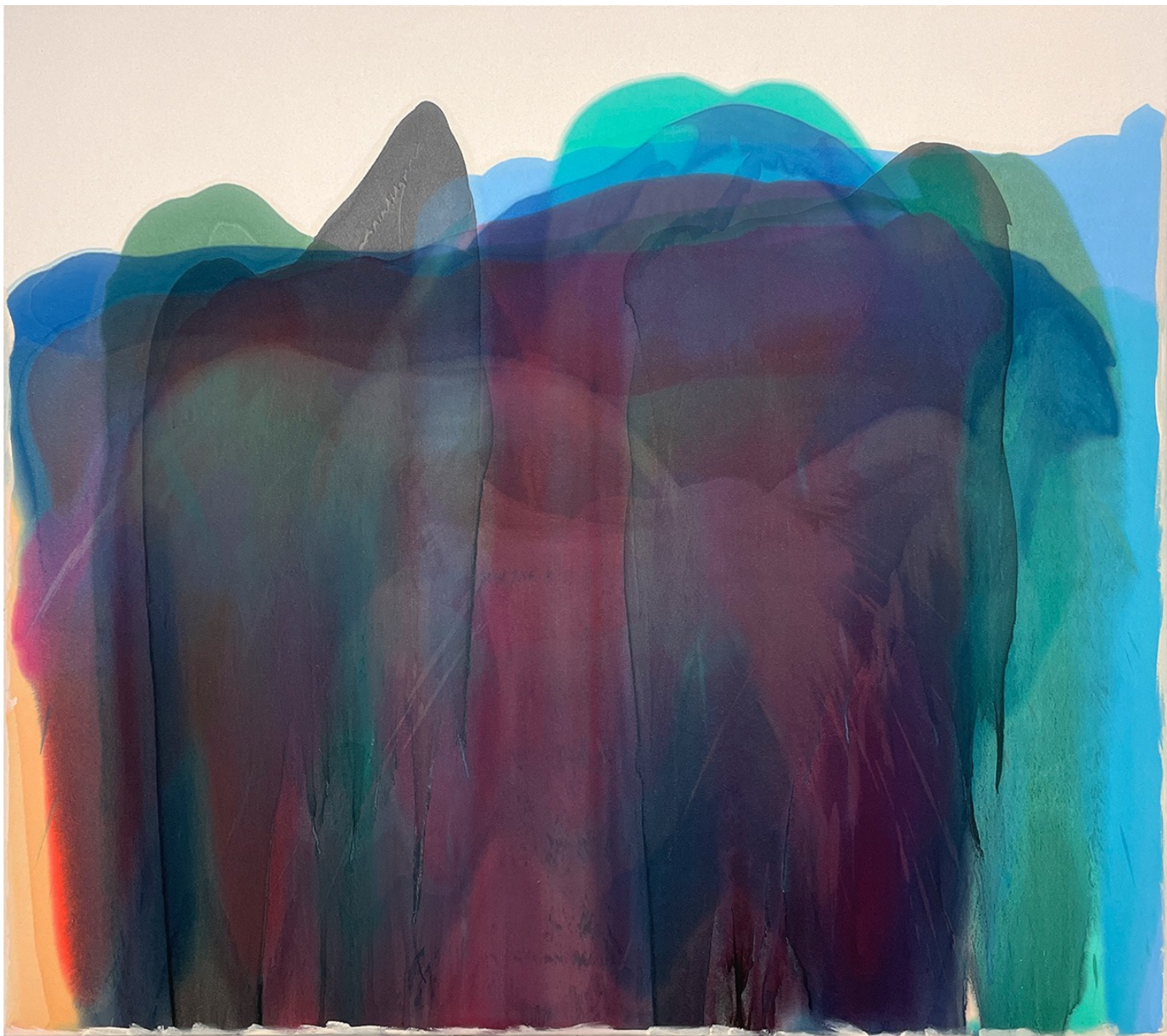
Marcel Rozek, Chapel, 2025, Oil and latex on canvas, 64 x 72 x 1.5 inches