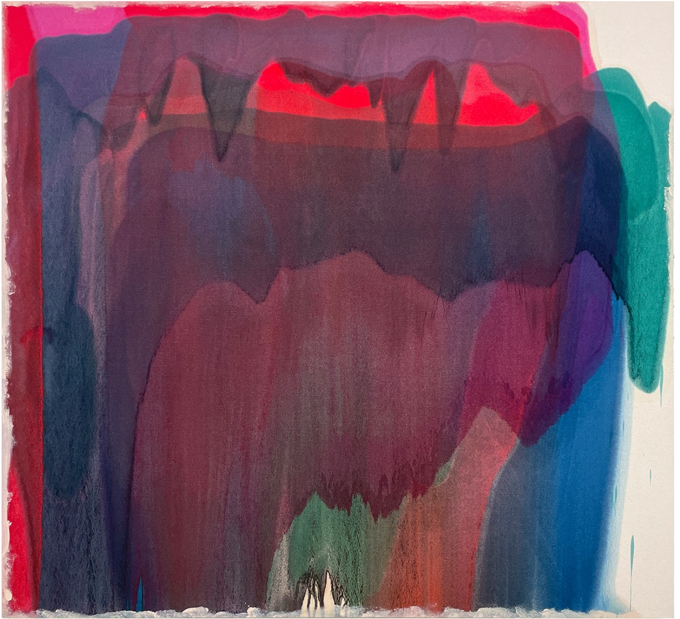
Marcel Rozek, The Day is Done , 2025, Oil and latex on canvas, 44 x 48 x 1.5 inches, $9,200