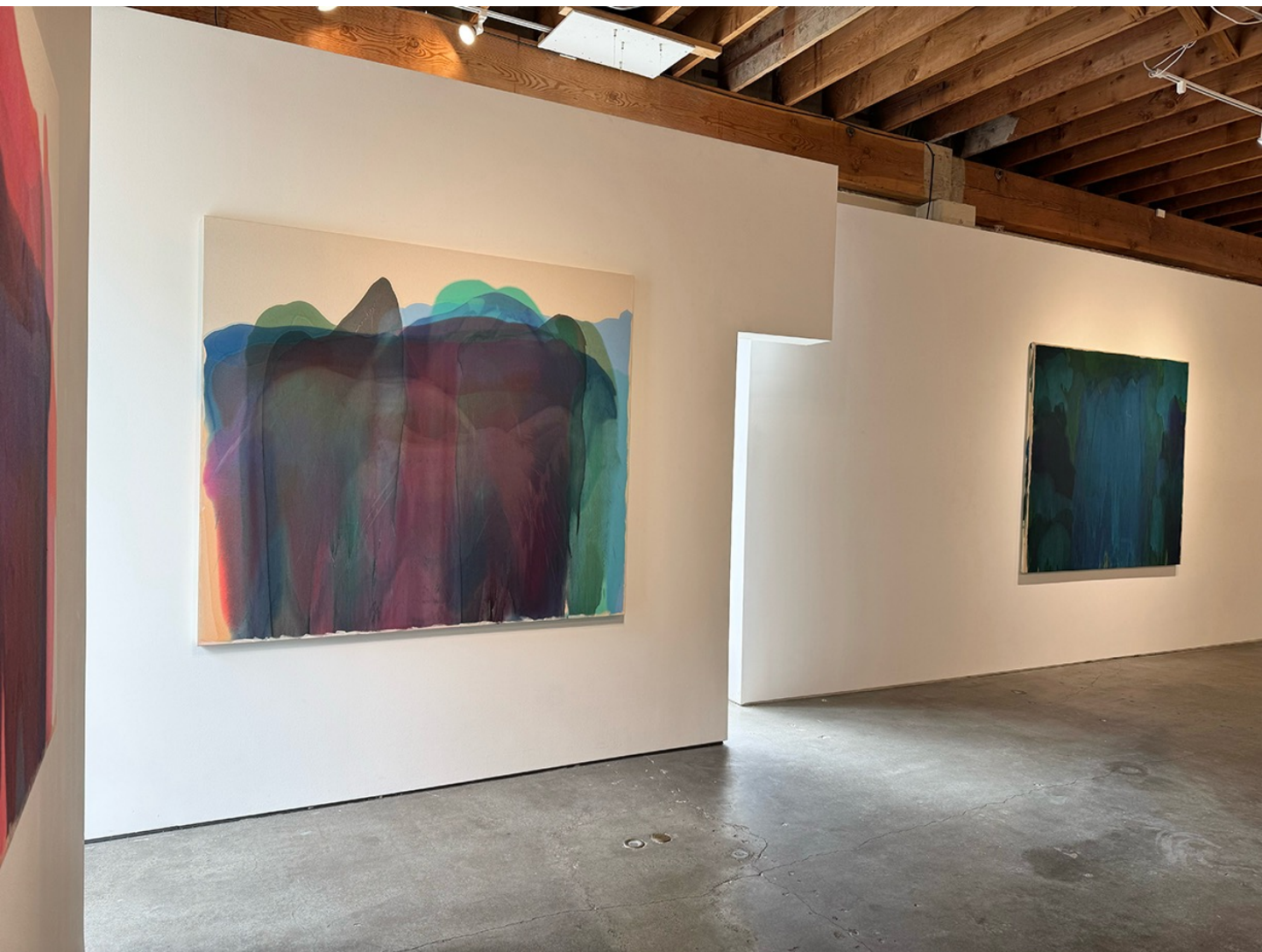
Marcel Rozek, Frame of Mind, Gallery Installation