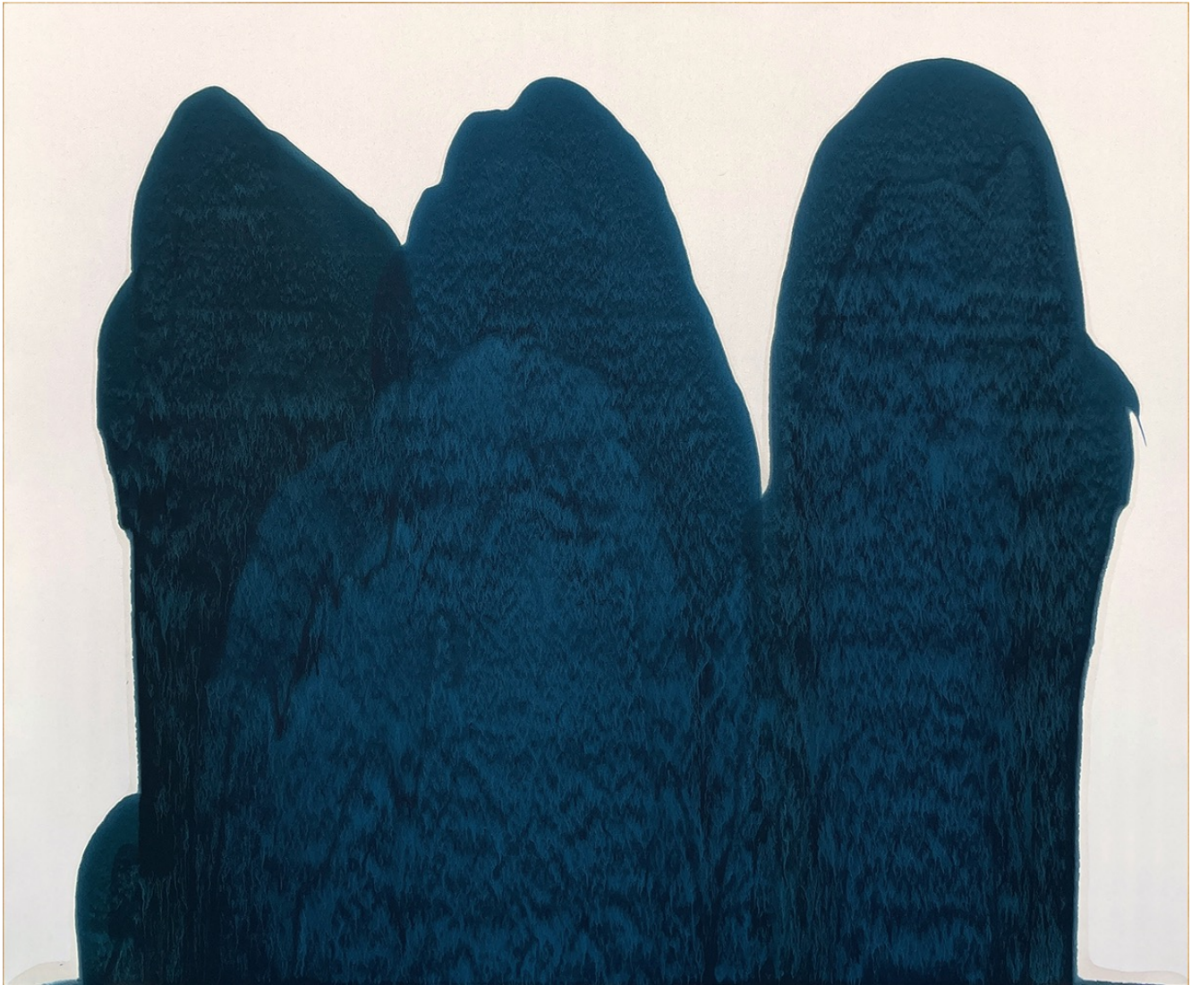
Marcel Rozek, Landslide, 2024, Oil and latex on canvas, 64 x 78 x 1.5 inches, $14,200