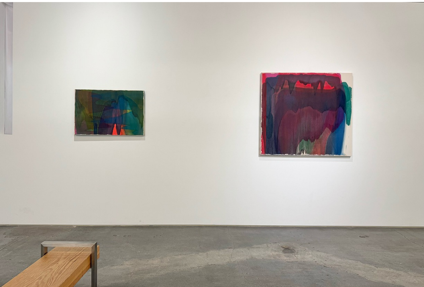
Marcel Rozek, Frame of Mind, Gallery Installation