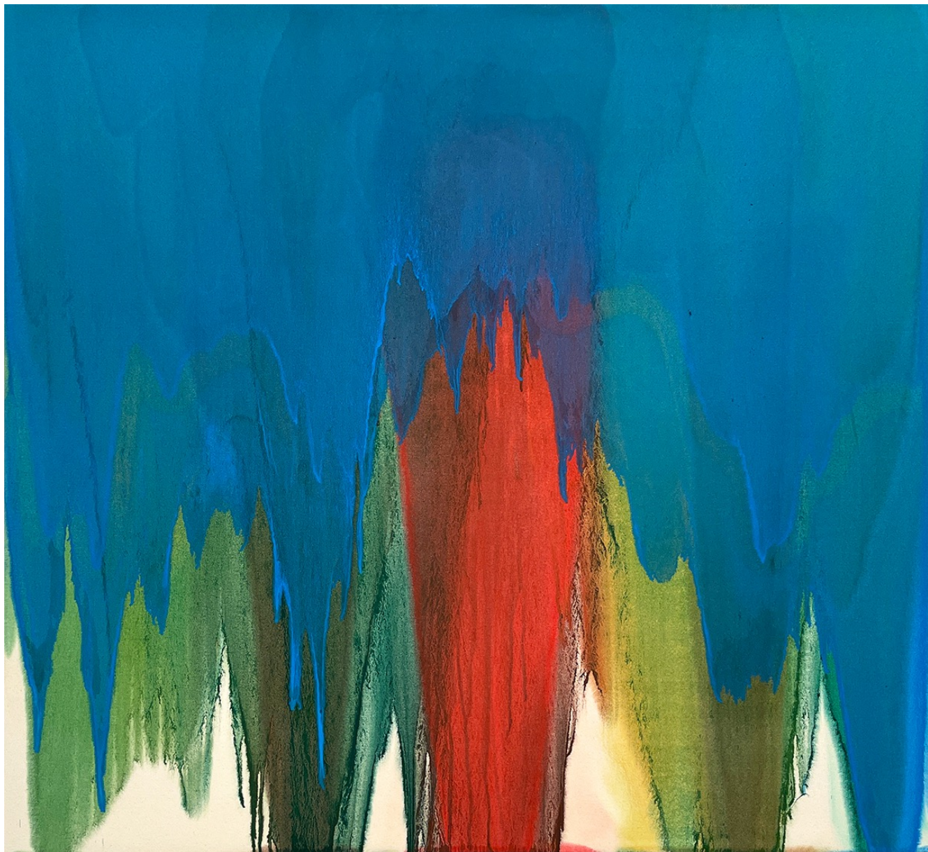
Marcel Rozek, Mess of Blues , 2025, Oil and latex on canvas, 44 x 48 x 1.5 inches, $9,200