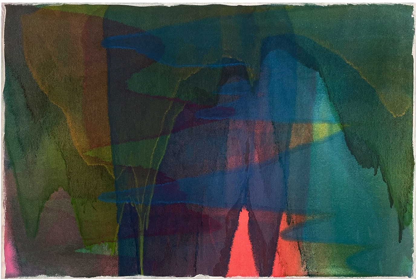
Marcel Rozek, Aspects , 2025, Oil and latex on canvas, 24 x 36 x 1.5 inches, $6,000