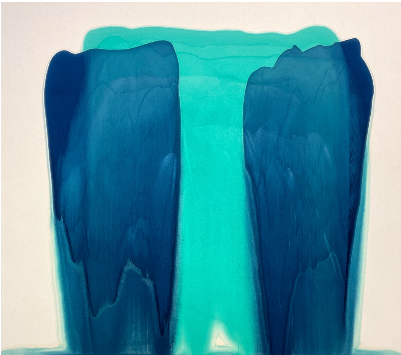
Marcel Rozek, Want Some Air , 2025, Oil and latex on canvas, 64 x 72 x 1.5 inches, $13,600