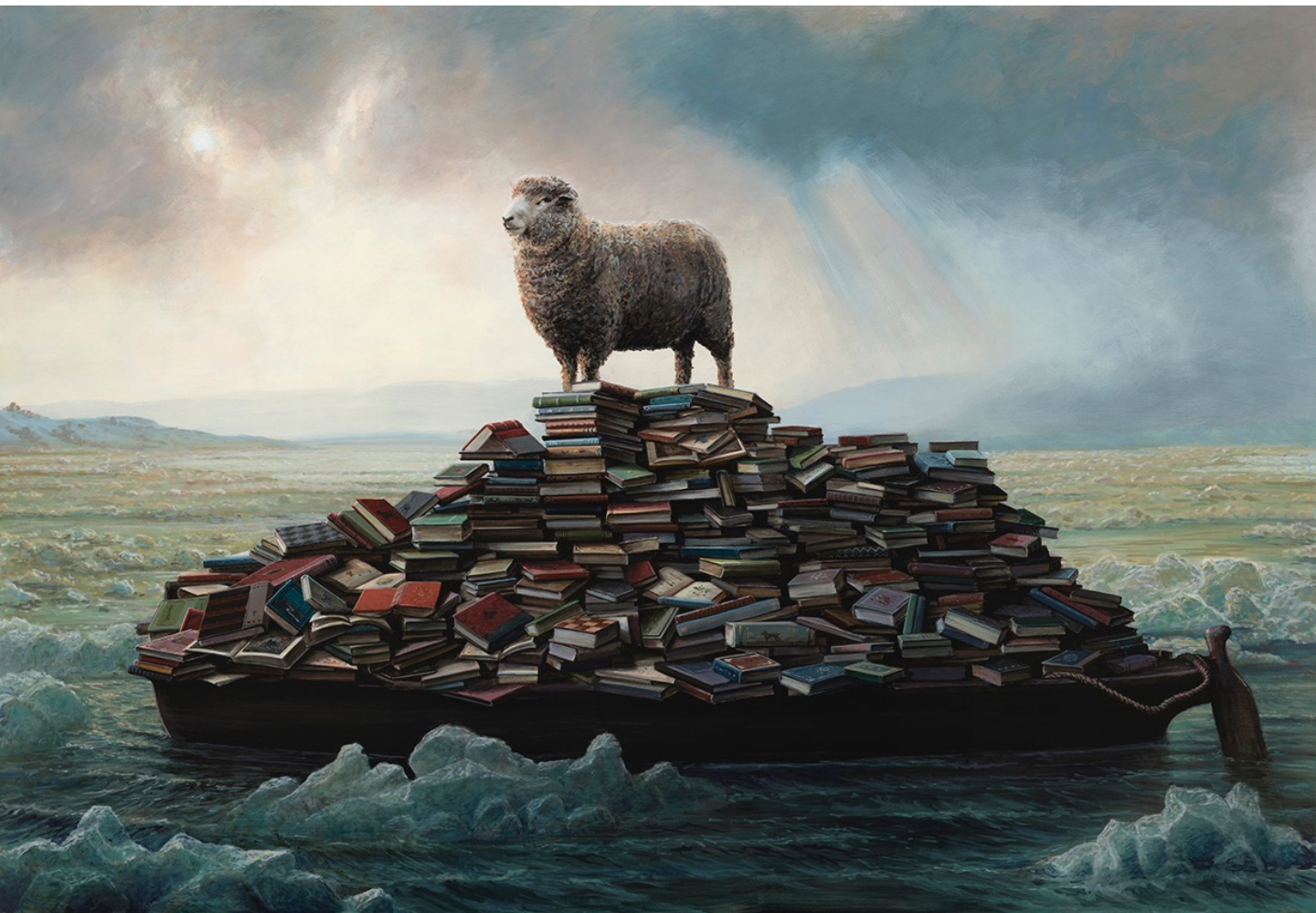
Ethan Murrow, Bell Ringer , 2025, Acrylic on panel, 66 x 96 x 2 inches, $82,000