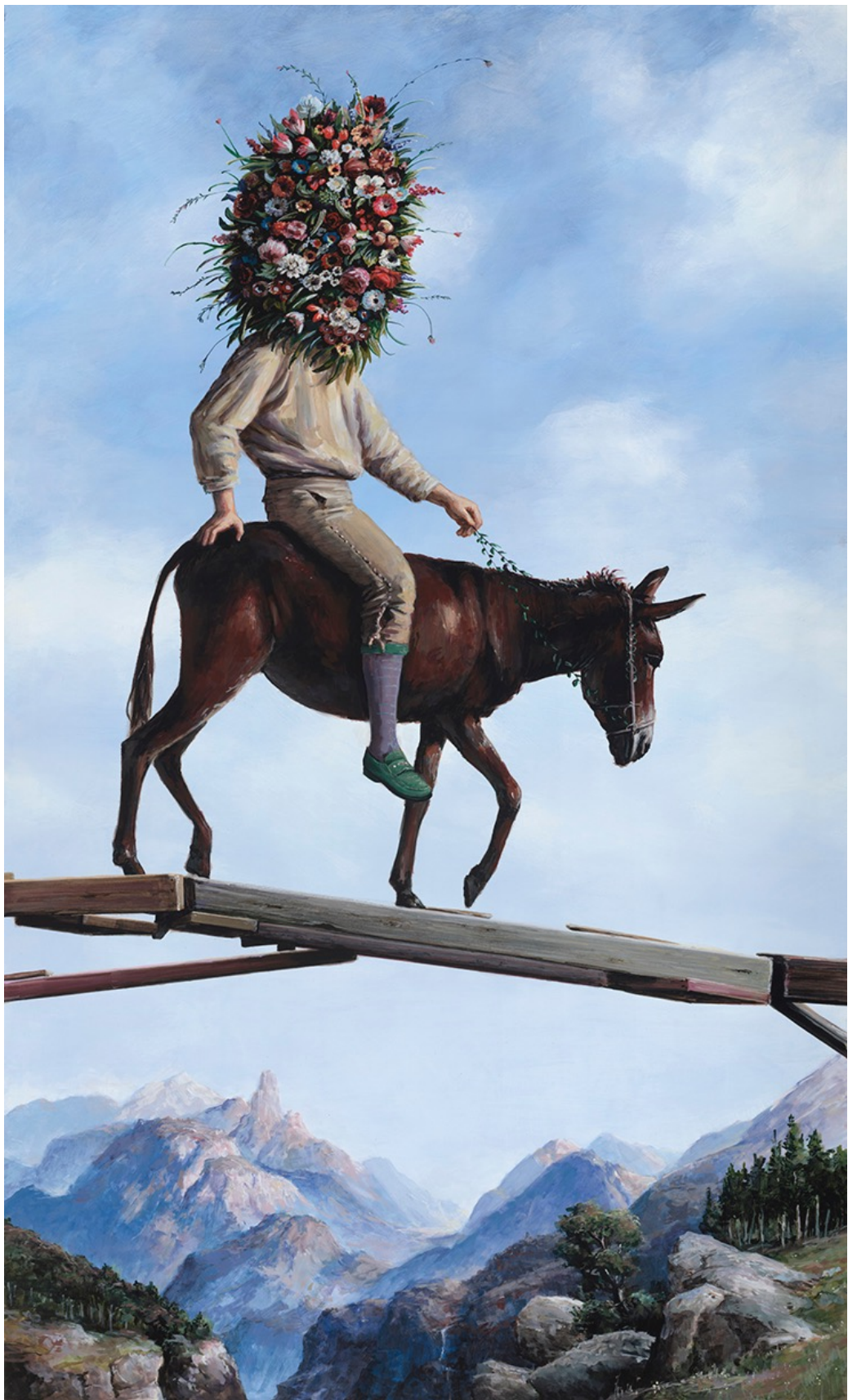
Ethan Murrow, The Agreement , 2025, Acrylic on panel, 60 x 36 x 2 inches, $38,000