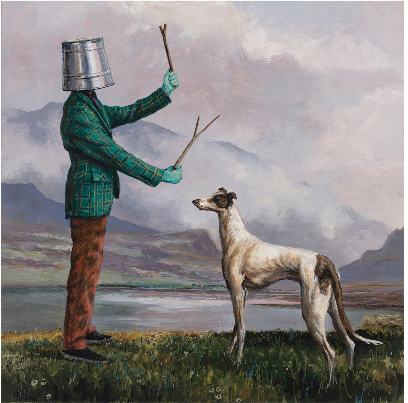
Ethan Murrow, Butler, 2025, Acrylic on panel, 12 x 12 x 2 inches, $5,500