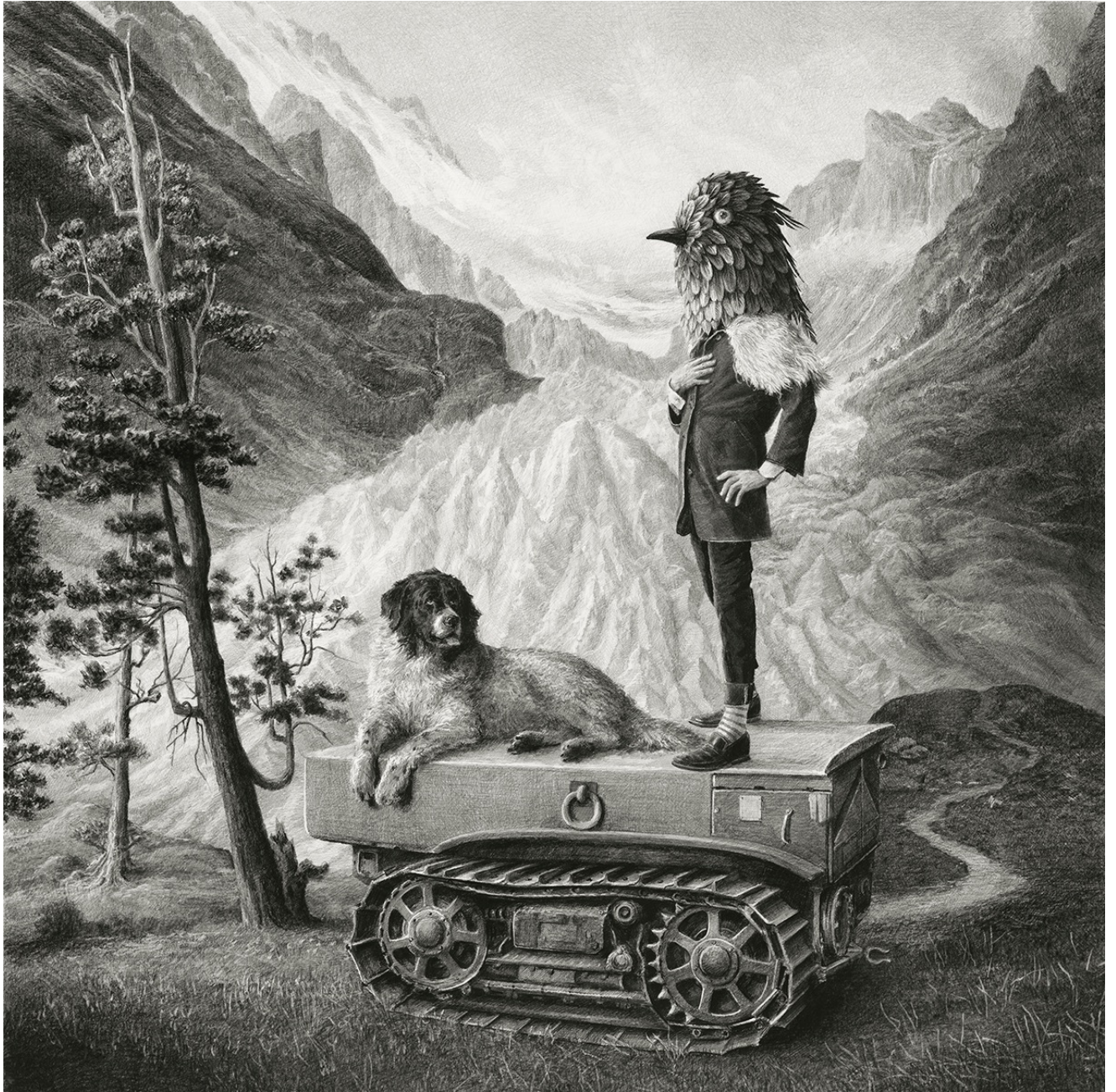
Ethan Murrow, Triumverate , 2025, Graphite on paper, 40 x 40 inches, Framed size 44.75 x 44.75 x 2 inches $28,000