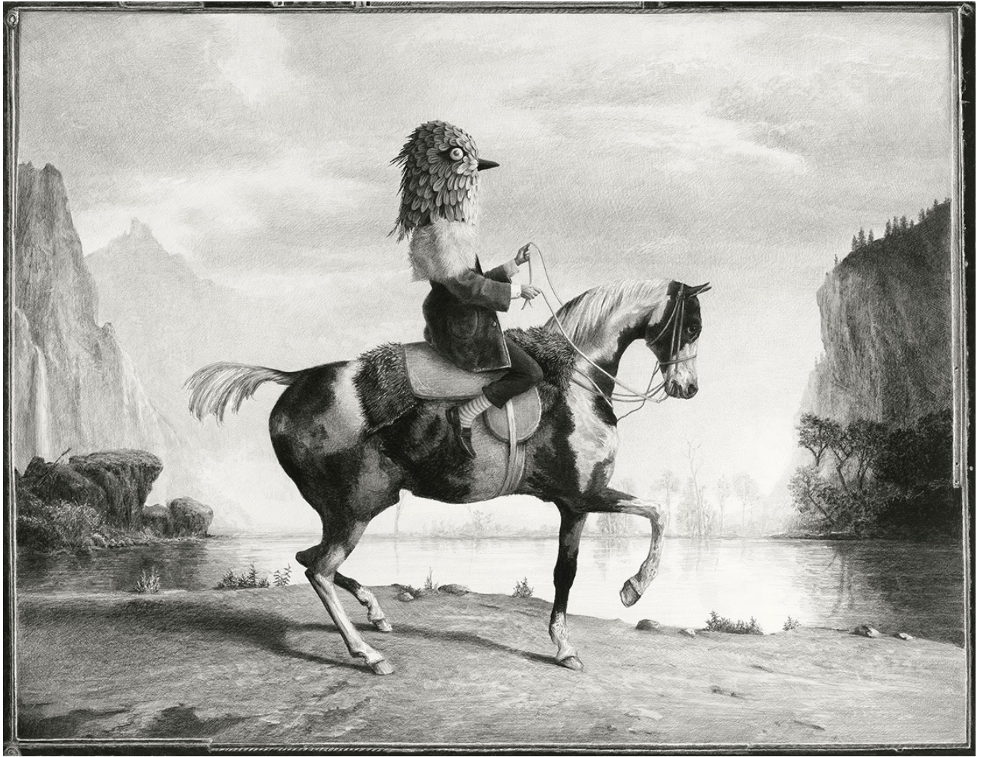
Ethan Murrow, Pegasus, 2025, Graphite on paper, 40 x 52 inches, Framed size 44.75 x 56.5 x 2 inches, $32,000