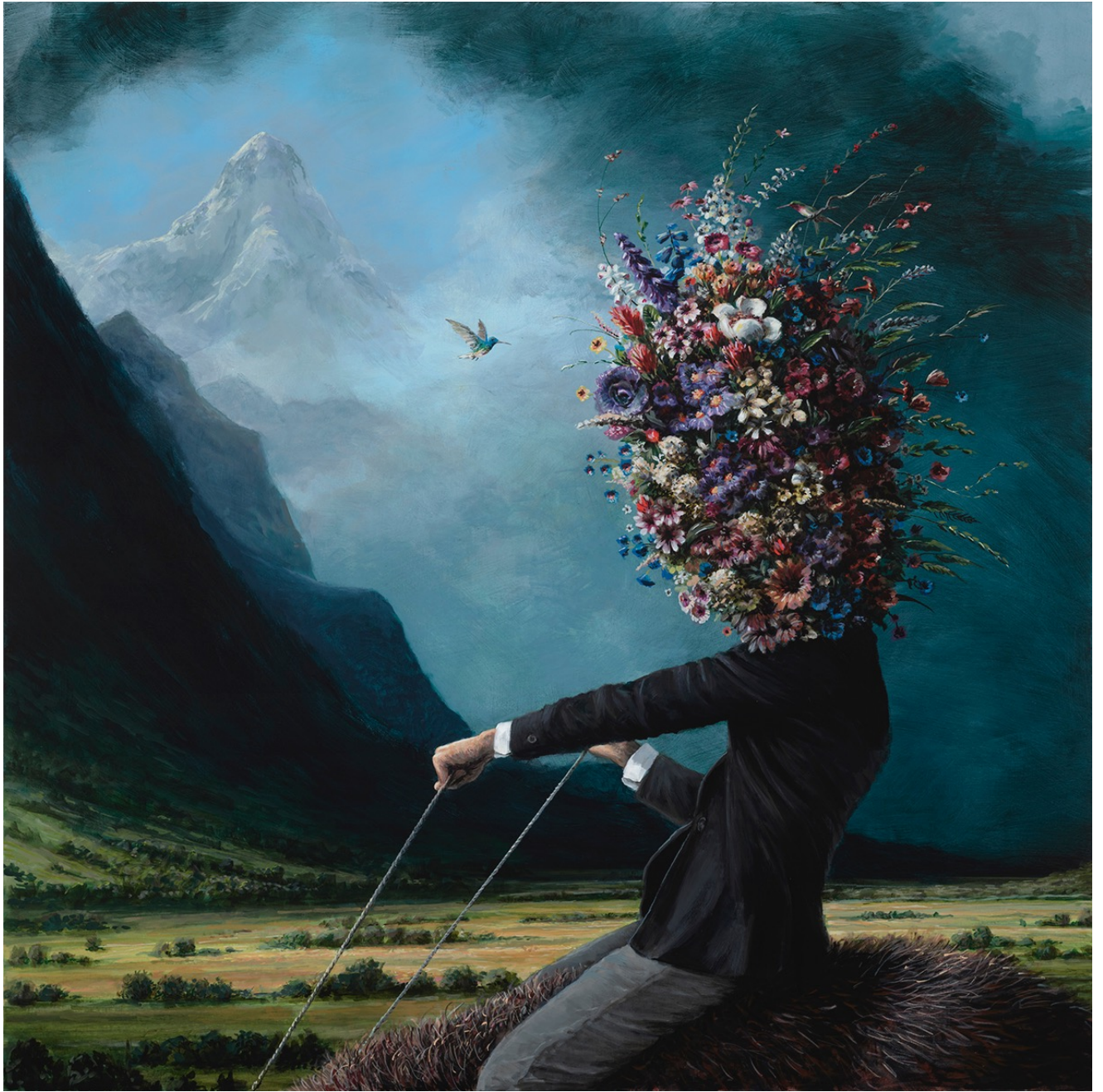
Ethan Murrow, Mythmaker, 2025, Acrylic on panel, 48 x 48 x 2 inches