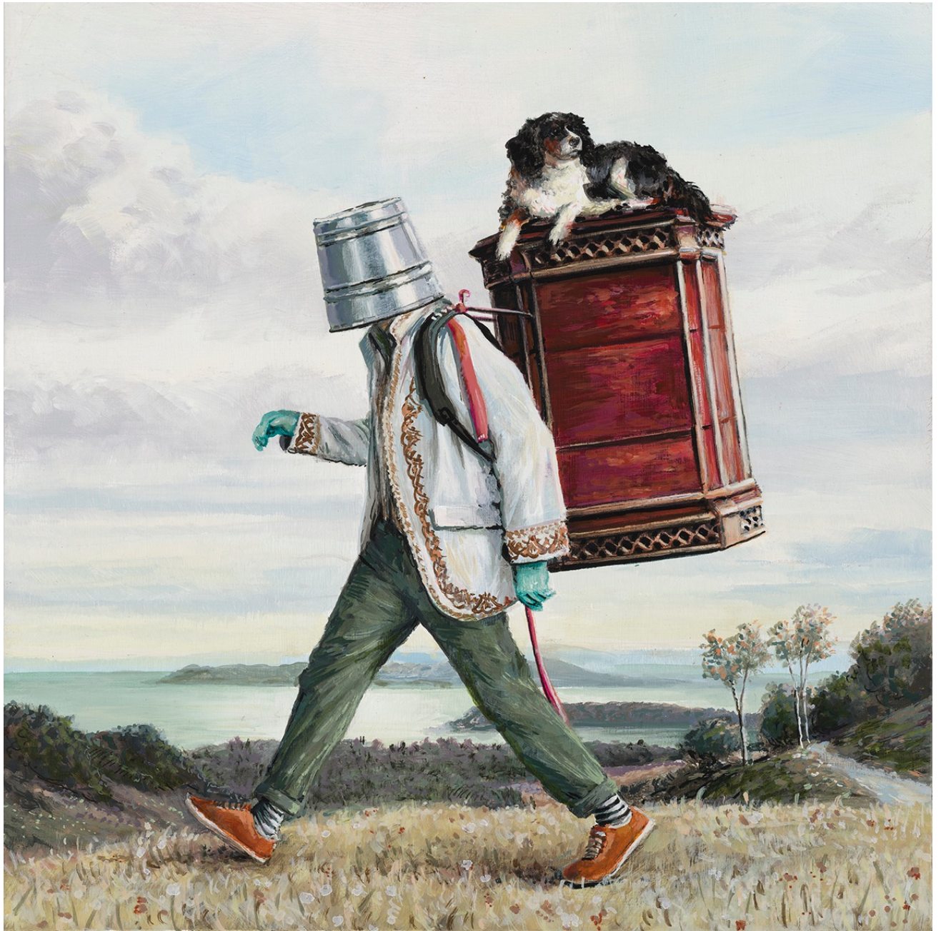
Ethan Murrow, Chauffeur , 2025, Acrylic on panel, 12 x 12 x 2 inches, $5,500