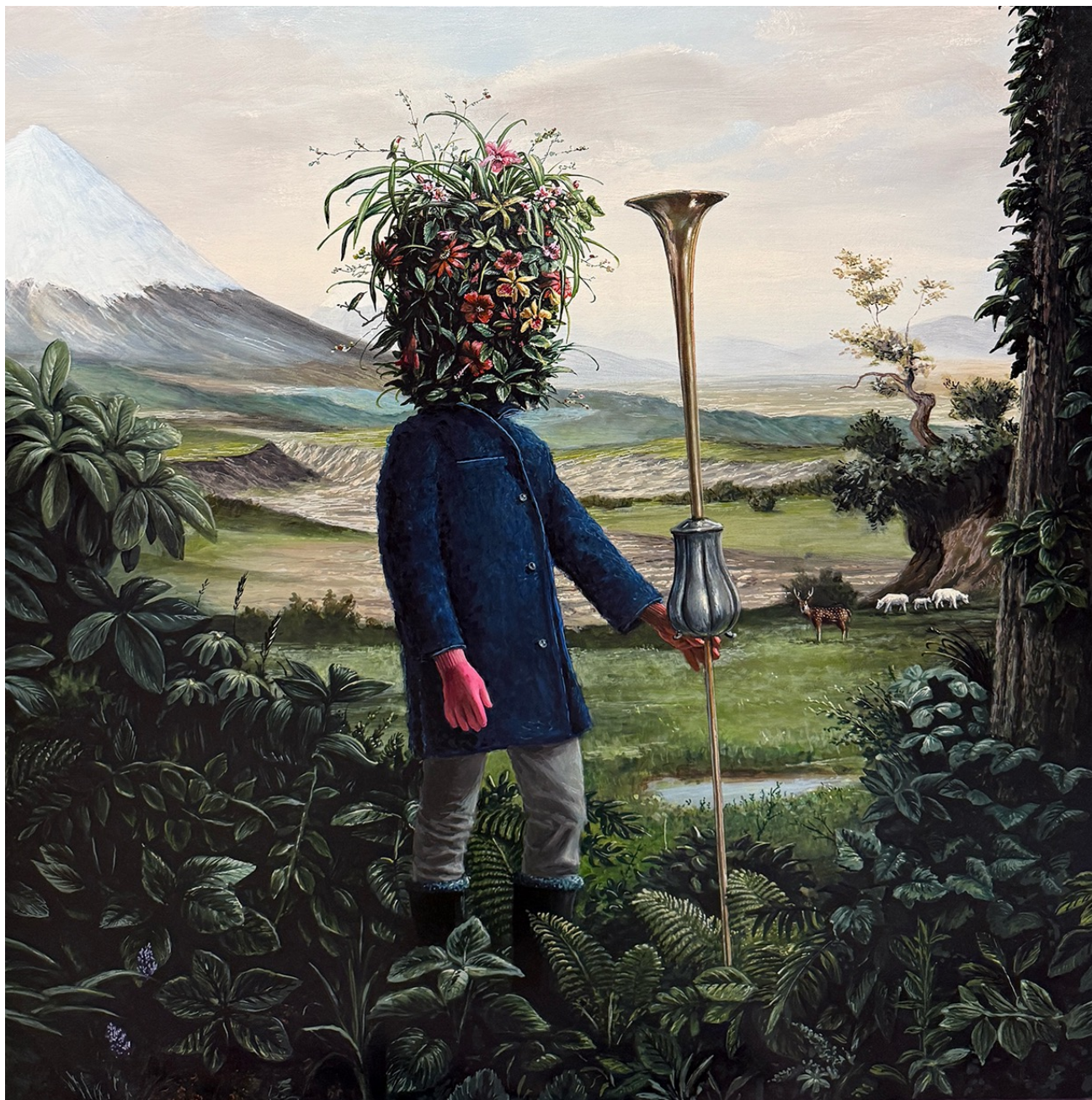
Ethan Murrow, Murmurs and Echoes , 2025, Acrylic on panel, 48 x 48 x 2 inches, $40,000