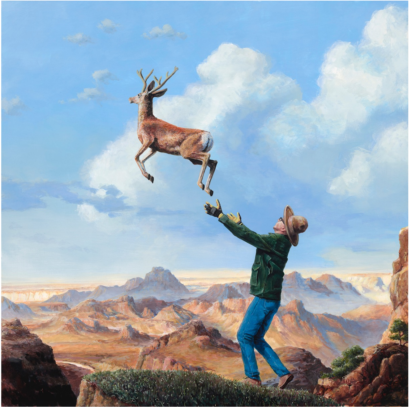
Ethan Murrow, Fence Mend, 2025, Acrylic on panel, 48 x 48 x 2 inches