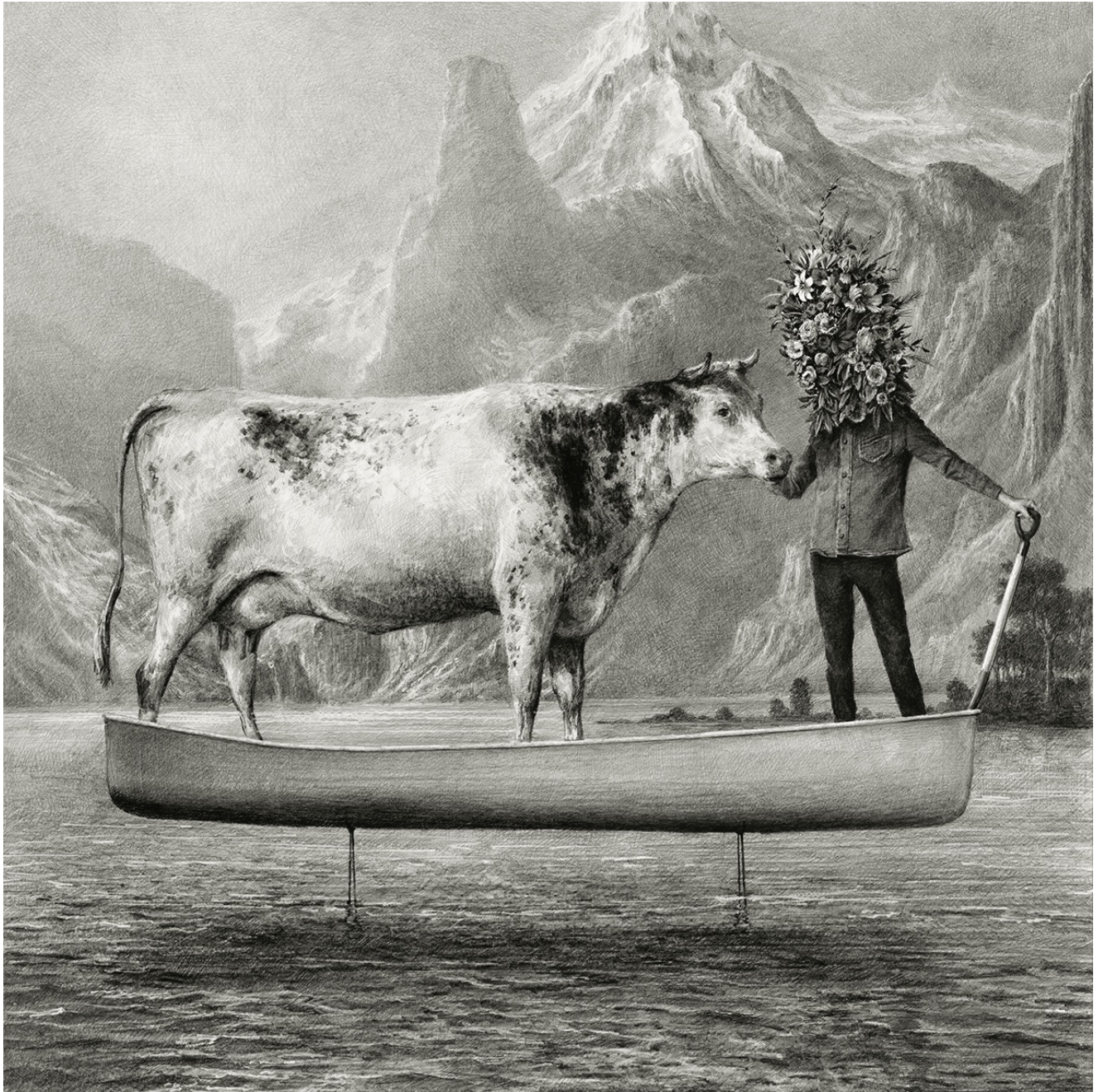
Ethan Murrow, Federation, 2025, Graphite on paper, 36 x 36 inches