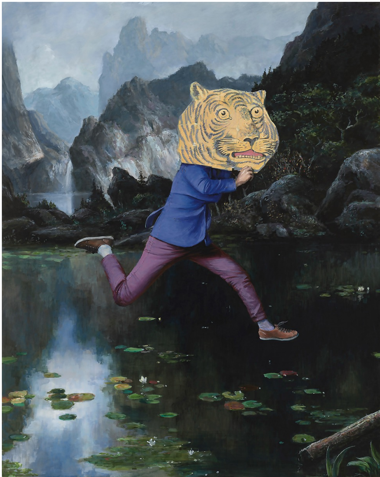
Ethan Murrow, Interpose , 2025, Acrylic on panel, 60 x 48 x 2 inches, $45,000