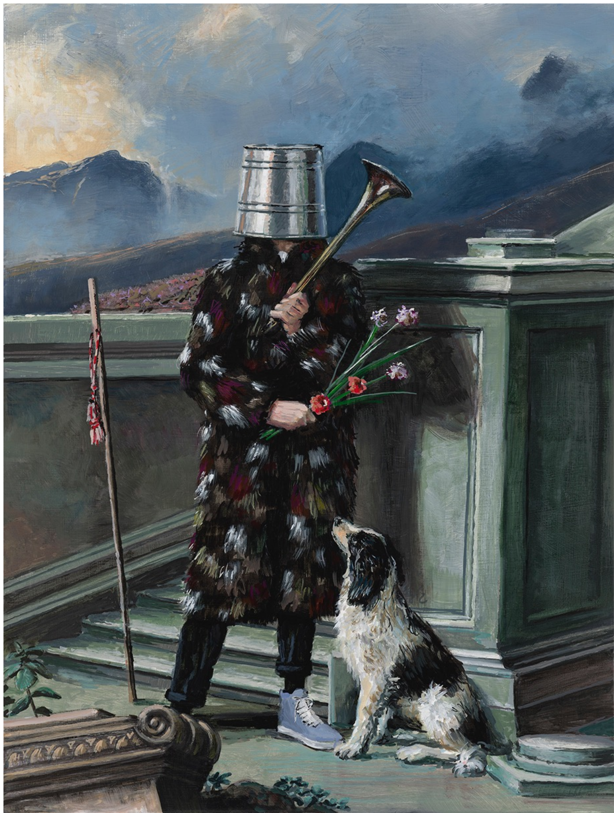
Ethan Murrow, Housekeeper, 2025, Acrylic on panel, 16 x 12 x 2 inches, $6,500