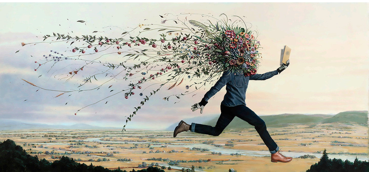
Ethan Murrow, The Gifter , 2023, Acrylic on canvas, 84 x 180 inches, $60,000