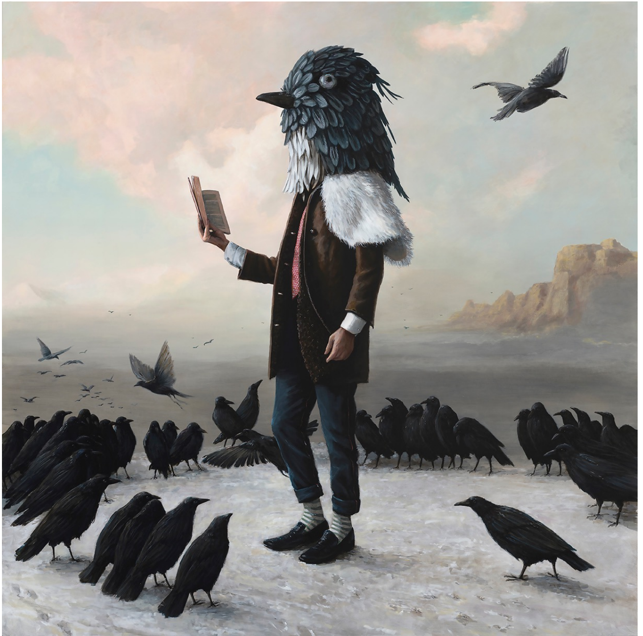
Ethan Murrow, The Parliament of Fowls , 2025, Acrylic on panel, 60 x 60 x 2 inches, $54,000