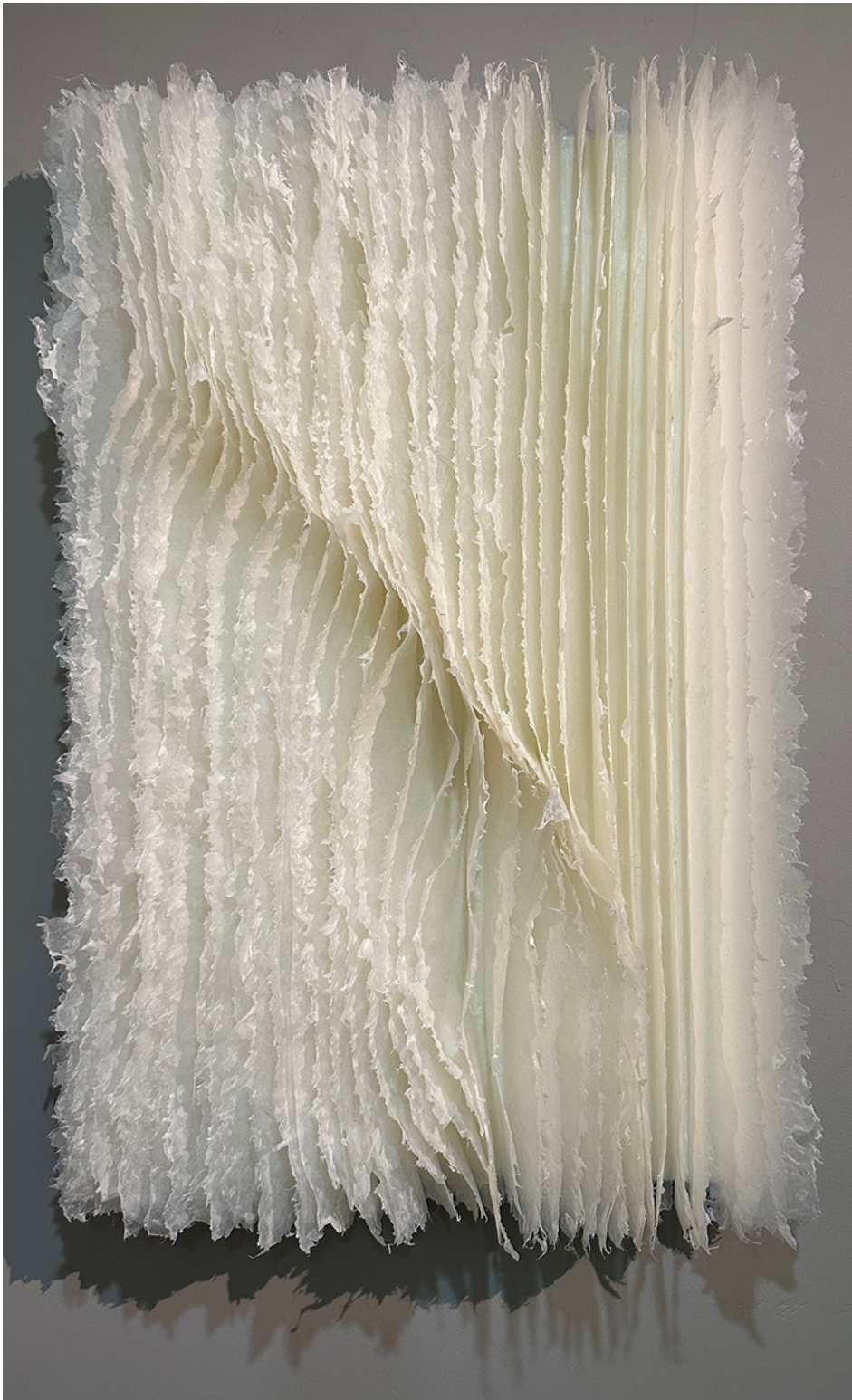
Kandis Susol, Moment of Clarity , 2025, Encaustic Sculpture, 33 x 23 x 5 inches, $9,000