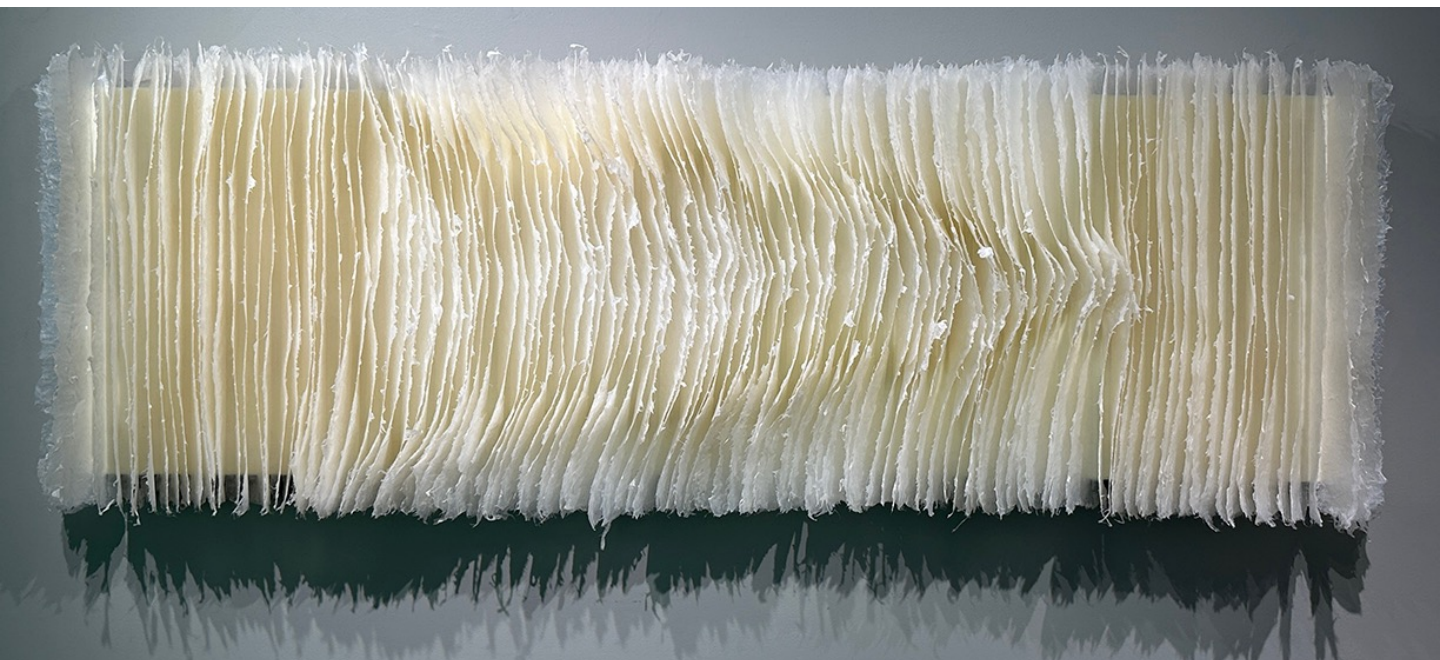
Kandis Susol, Into The Wind , 2025, Encaustic Sculpture, 22 x 62 x 5 inches, $16,000