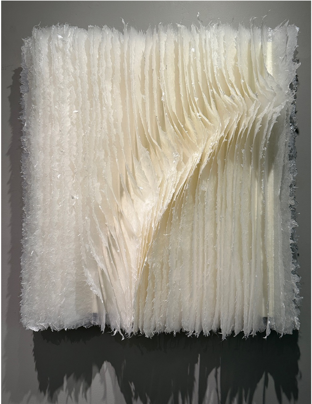
Kandis Susol, Simply Open , 2025, Encaustic sculpture, 29 x 27 x 5 inches, $10,000