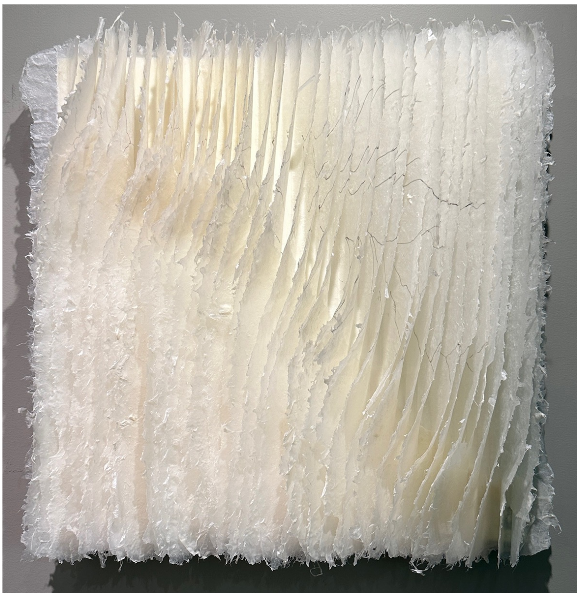
Kandis Susol, Growing Journey, 2025, Encaustic Sculpture, 23 x 23 x 5 inches, $8,000