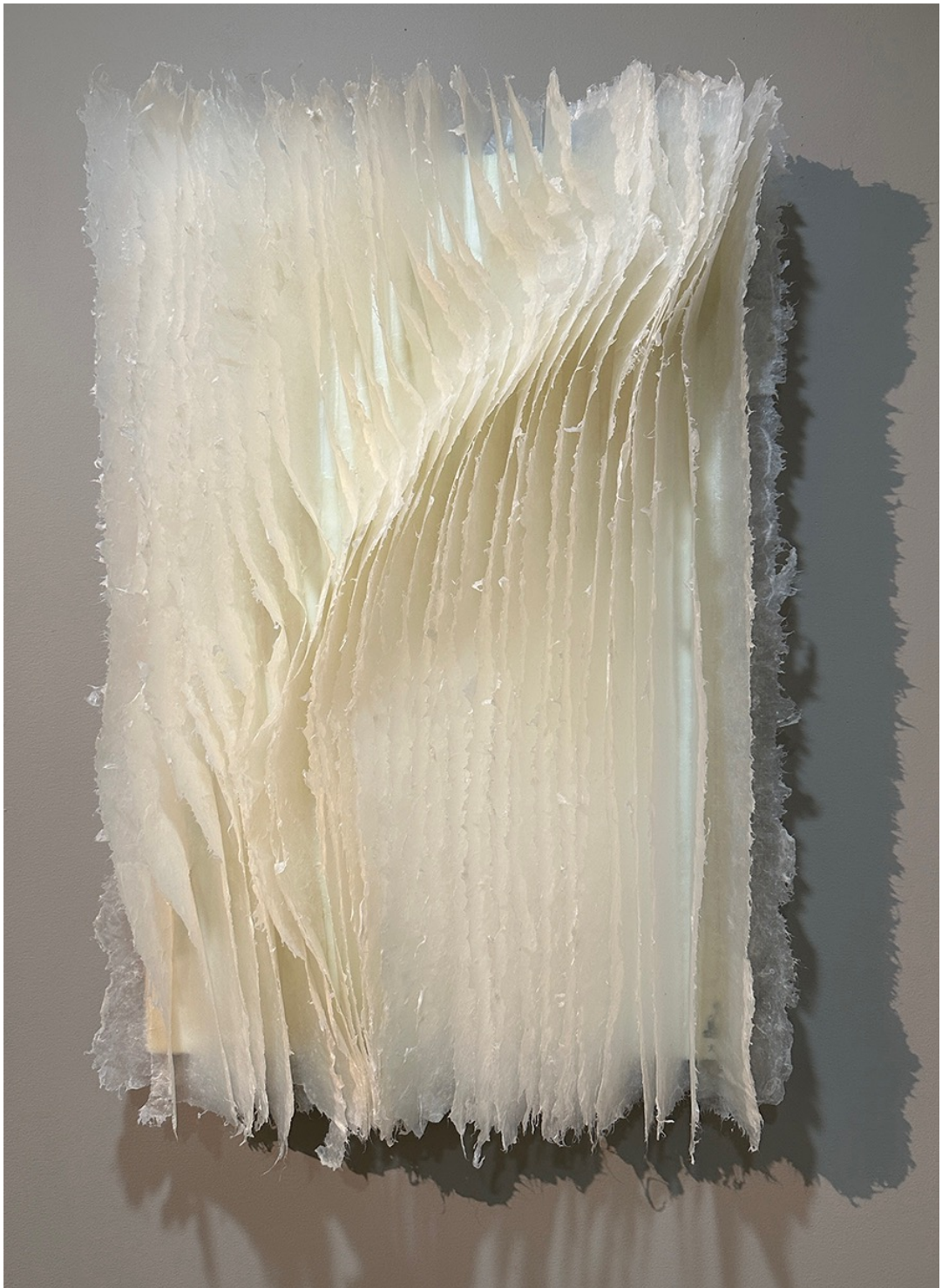
Kandis Susol, On The Edge of the Wind , 2025, Encaustic Sculpture, 28 x 20 x 5 inches, $8,000