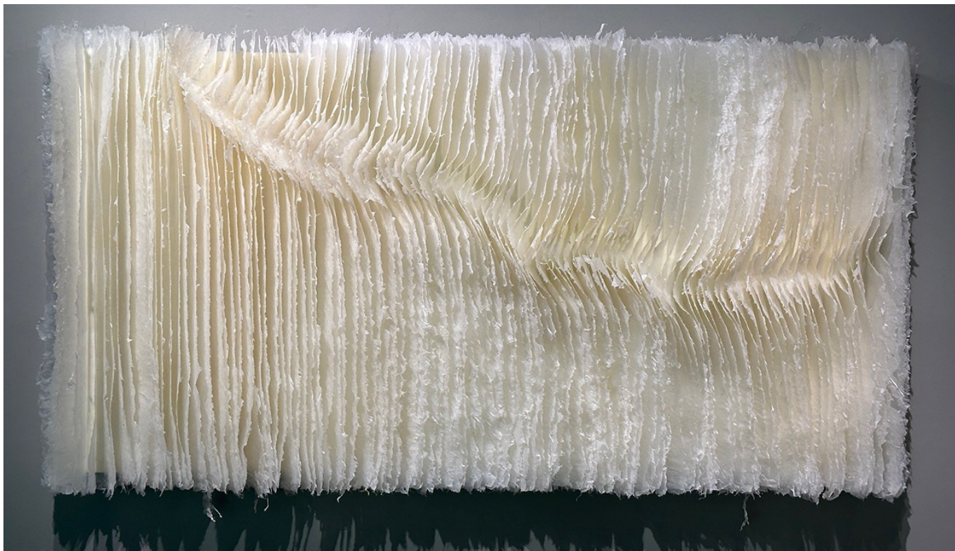
Kandis Susol, Dream Time , 2025, Encaustic Sculpture, 32 x 62 x 5 inches, $22,000