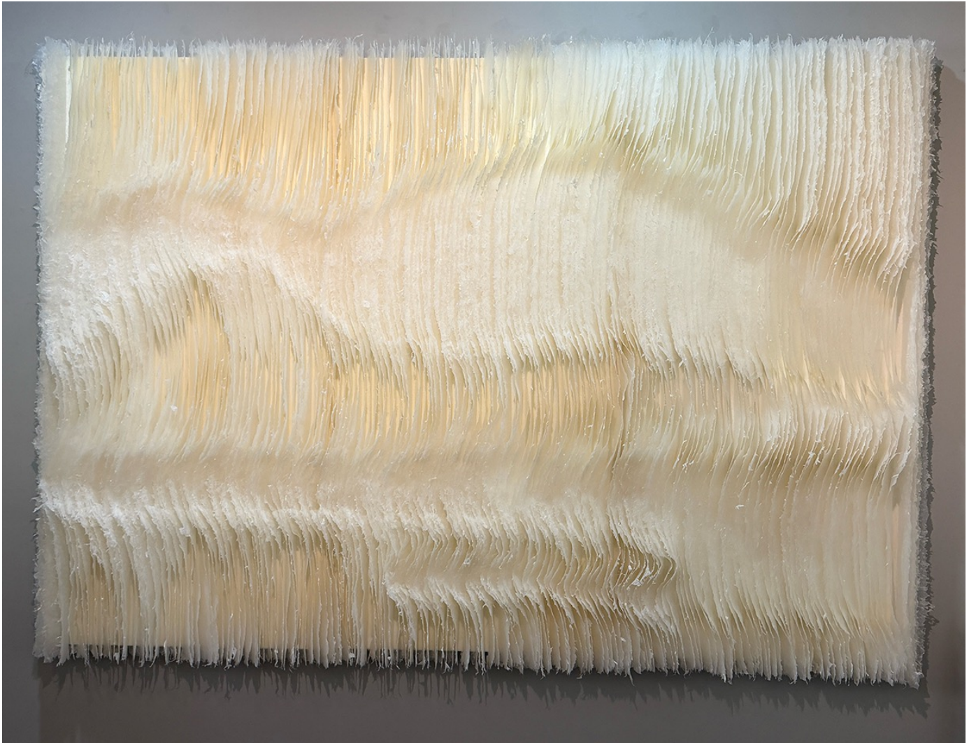
Kandis Susol, Field Far Beyond Form and Emptiness , 2025, Encaustic Sculpture, 60 x 84 x 5 inches, $50,000