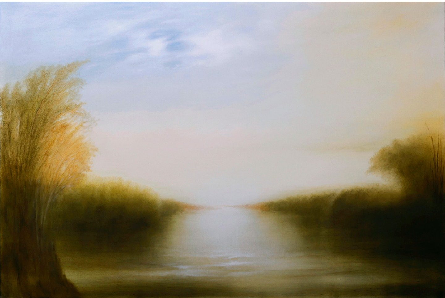
Hiro Yokose, Untitled #5508, 2023, Oil on canvas, 38 x 57 x 2.5 inches, $20,000