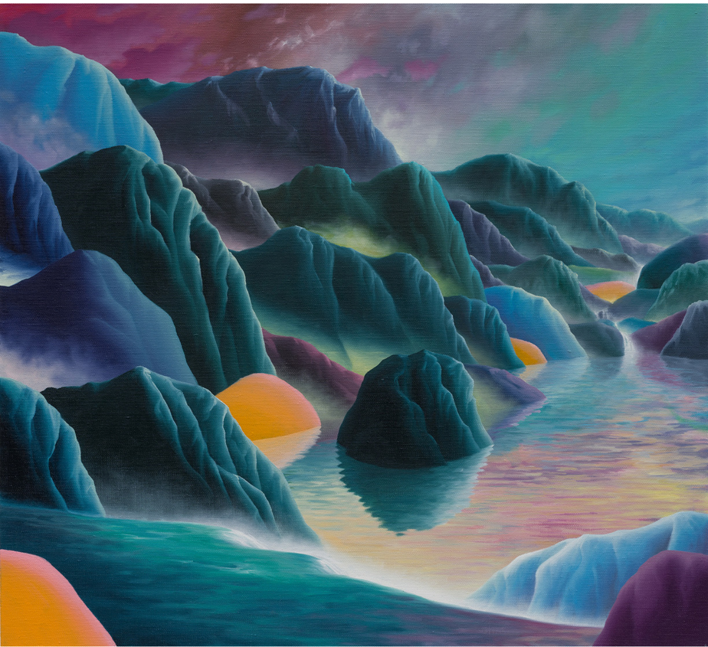
Adam Sorensen, Napier, 2024, Oil on linen, 23.25 x 25.25 x 1 inches, $5,500