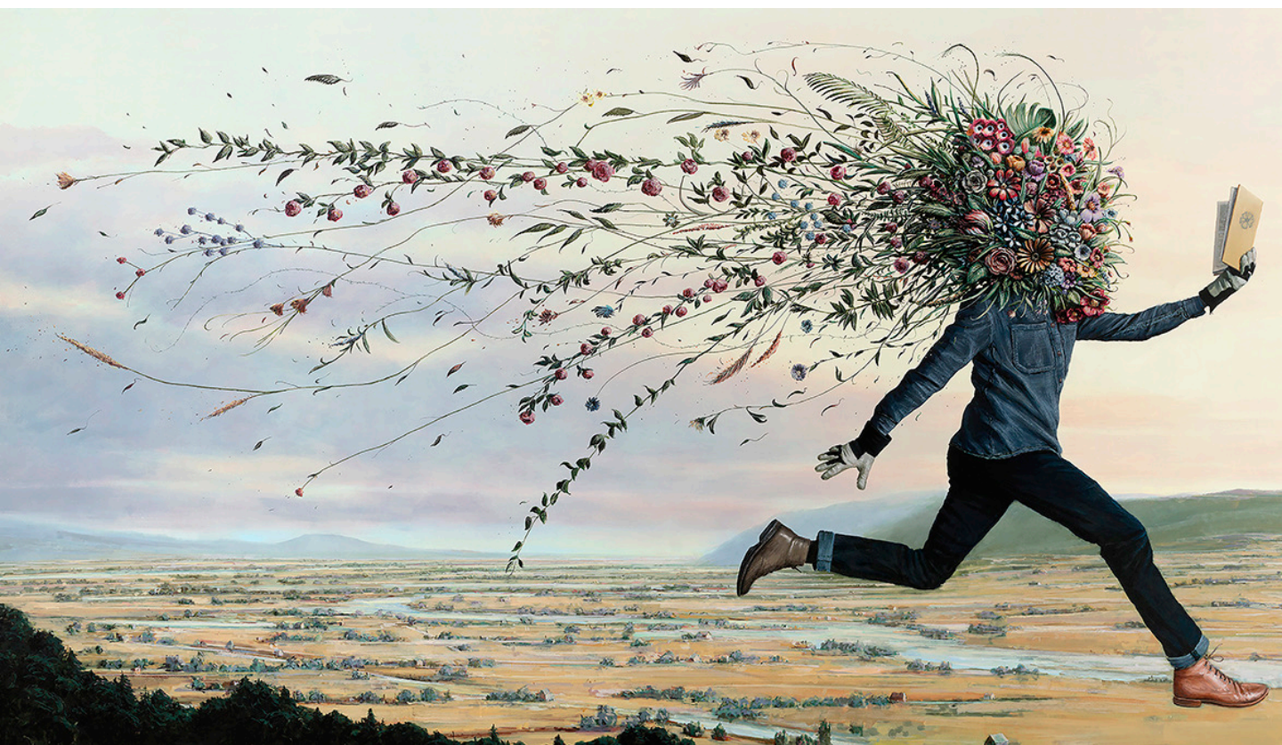
Ethan Murrow, The Gifter , 2023, Acrylic on canvas, 82 x 140 x 2 inches, $60,000