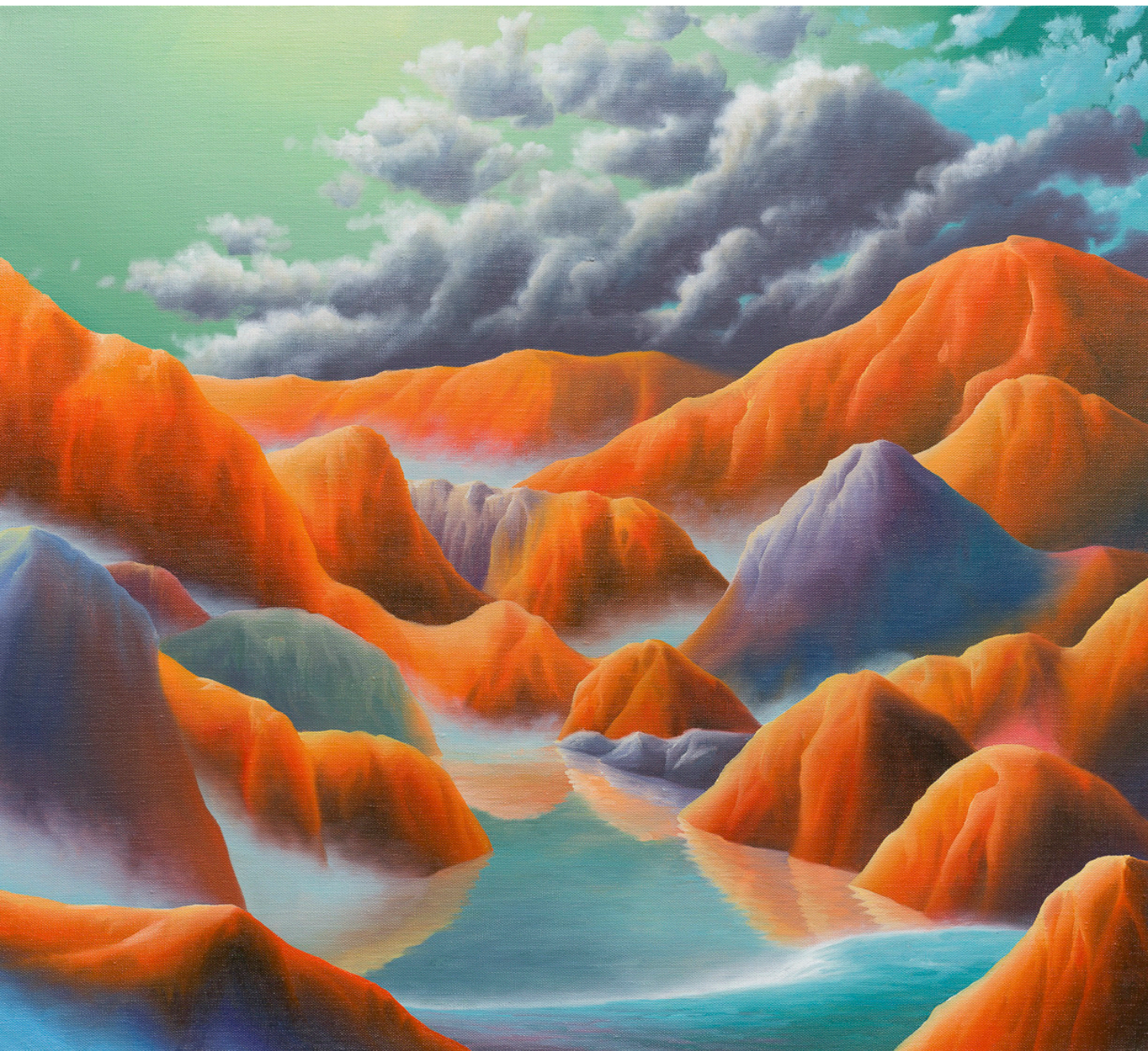
Adam Sorensen, Skeirt, 2024, Oil on linen, 23.25 x 25.25 x 1 inches, $5,500