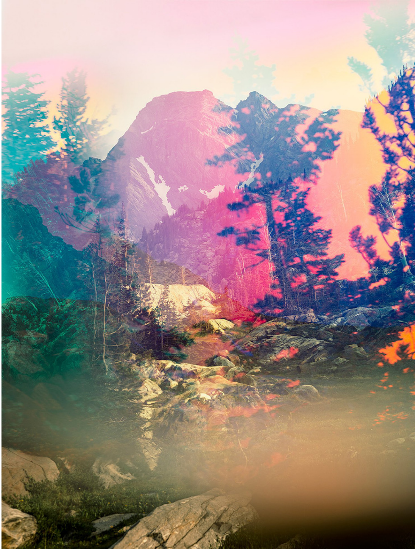
Terri Loewenthal, Psychscape 677 (Pine Creek Lake, MT), 2021, Archival pigment print, 40 x 30 inches, Edition of 3