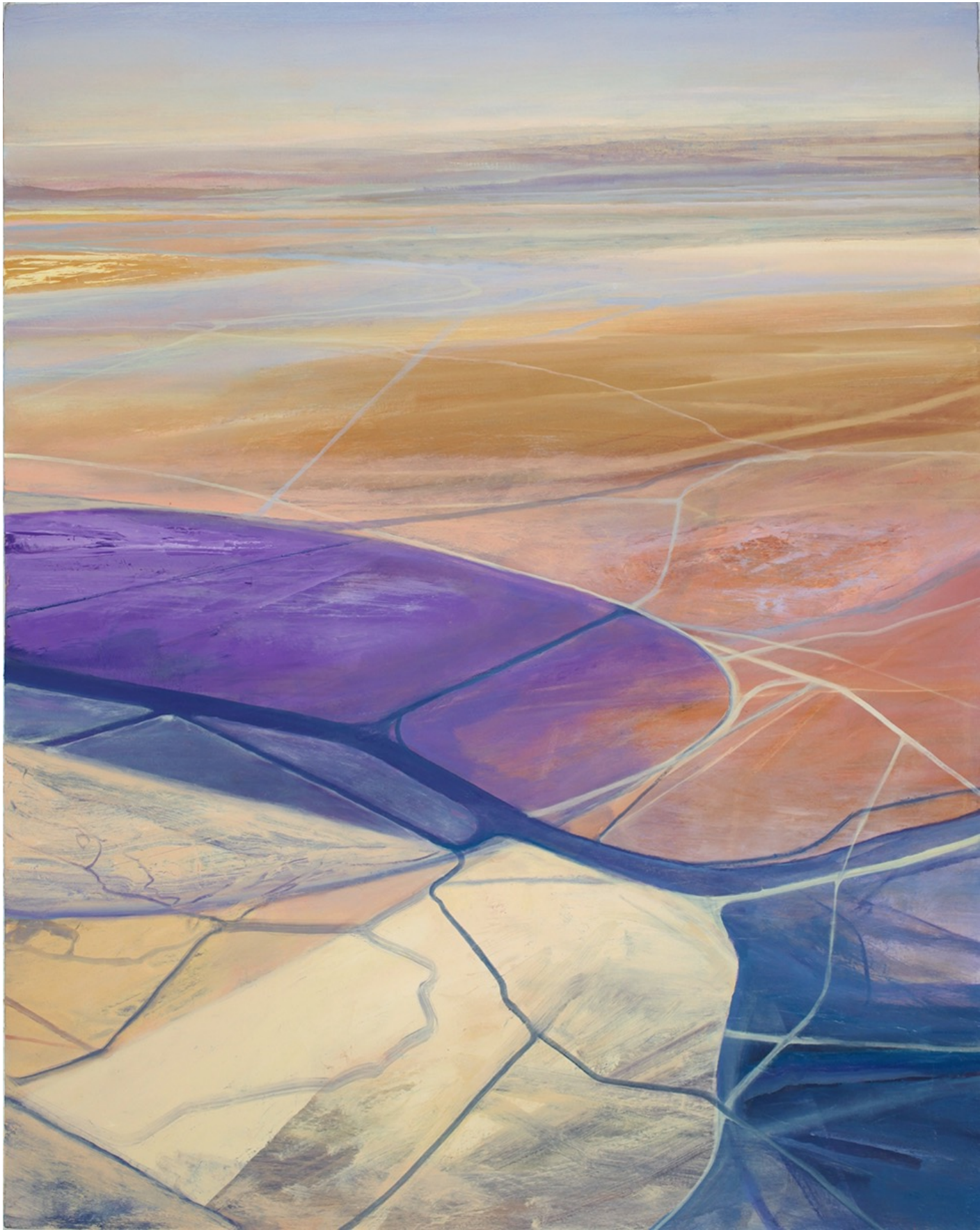
Philip Govedare, Arena, 2025, Oil on canvas 48 x 38 inches, Framed size 48.75 x 38.75 x 2.25 inches, $14,000