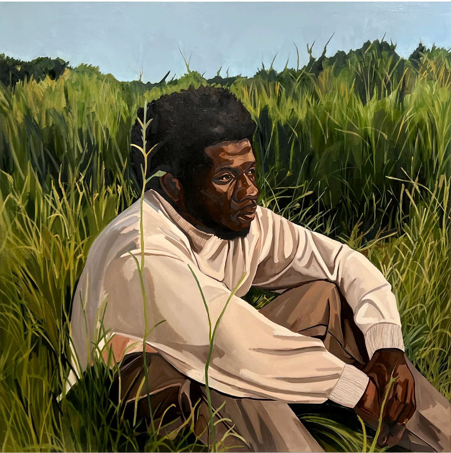
Barry Johnson, Somewhere to be Someone , 2025, Oil on canvas, 48 x 48 x 1.5 inches, $10,500