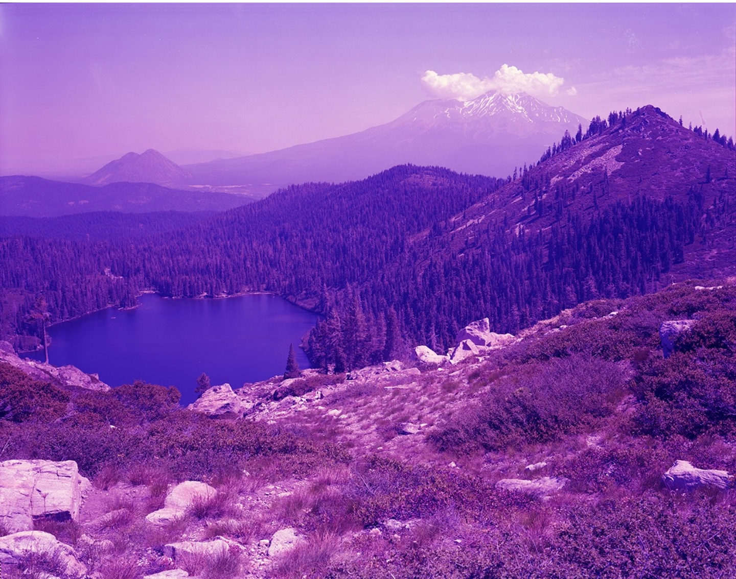
David Benjamin Sherry, North Cascades National Park, Washington, 2019, Chromogenic print, 40 x 50 inches, Framed size 42.25 x 52.25 x 2 inches, Edition of 3