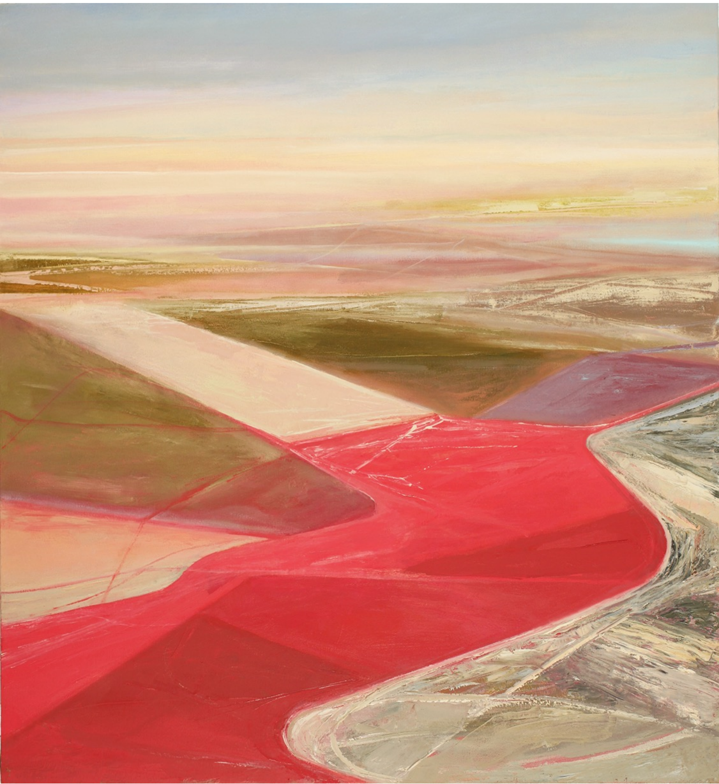
Philip Govedare, Aria , 2024, Oil on canvas 52 x 47 inches, Framed size 52.75 x 47.75 x 2.25 inches, $15,500