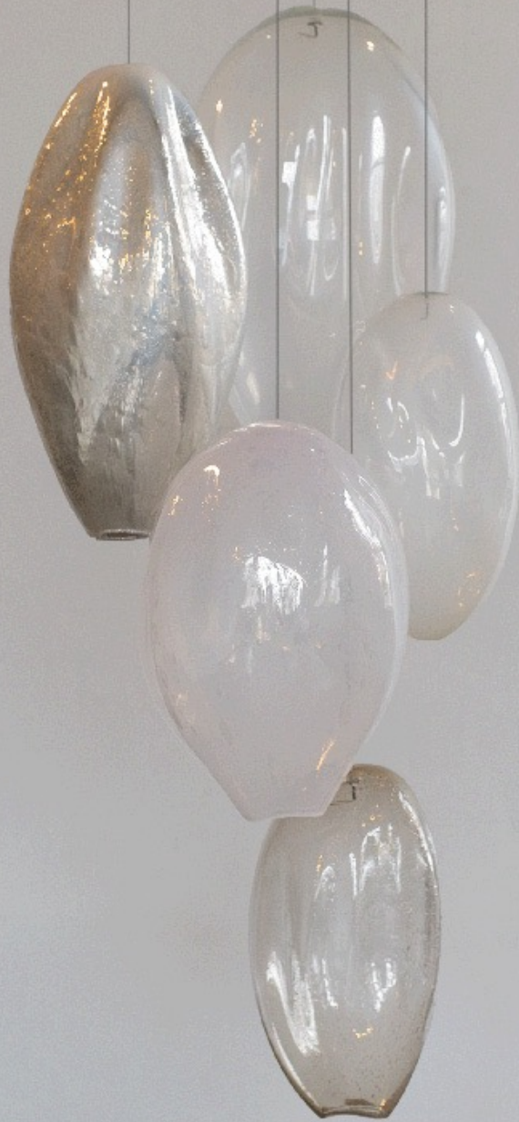
Ann Gardner, Trio H, 2026, Blown glass, 50 x 22 x 30 inches, $32000