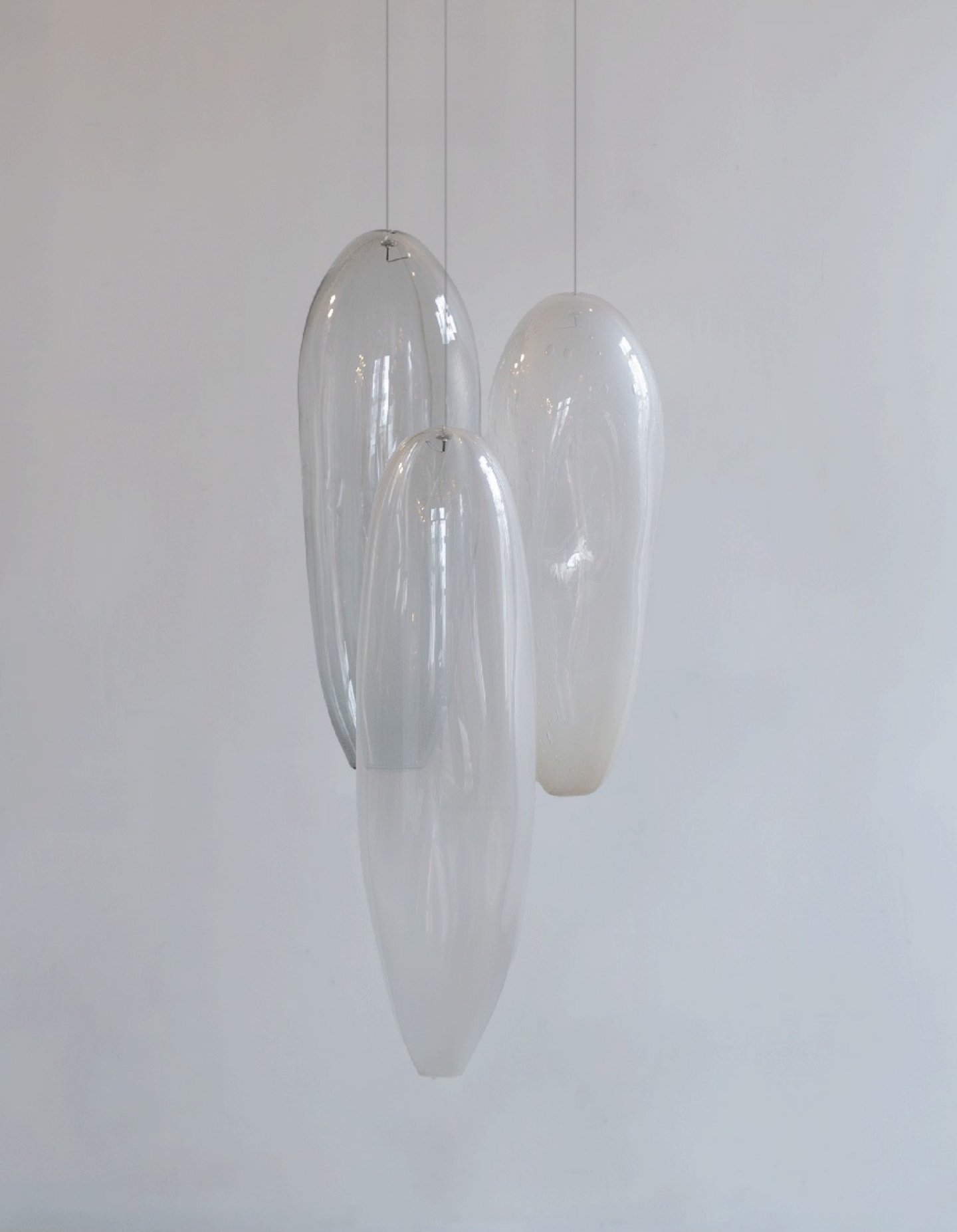
Ann Gardner, Trio B, 2026, Blown glass, 45 x 18 x 18 inches, $23000