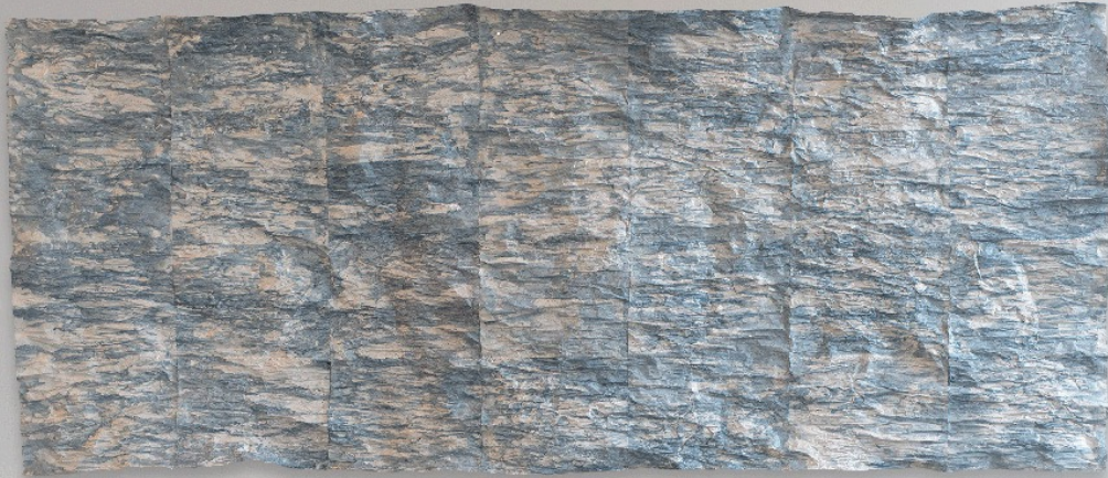
Ann Gardner, Water 7, 2026, Mixed media, 38 x 90 inches, $24000