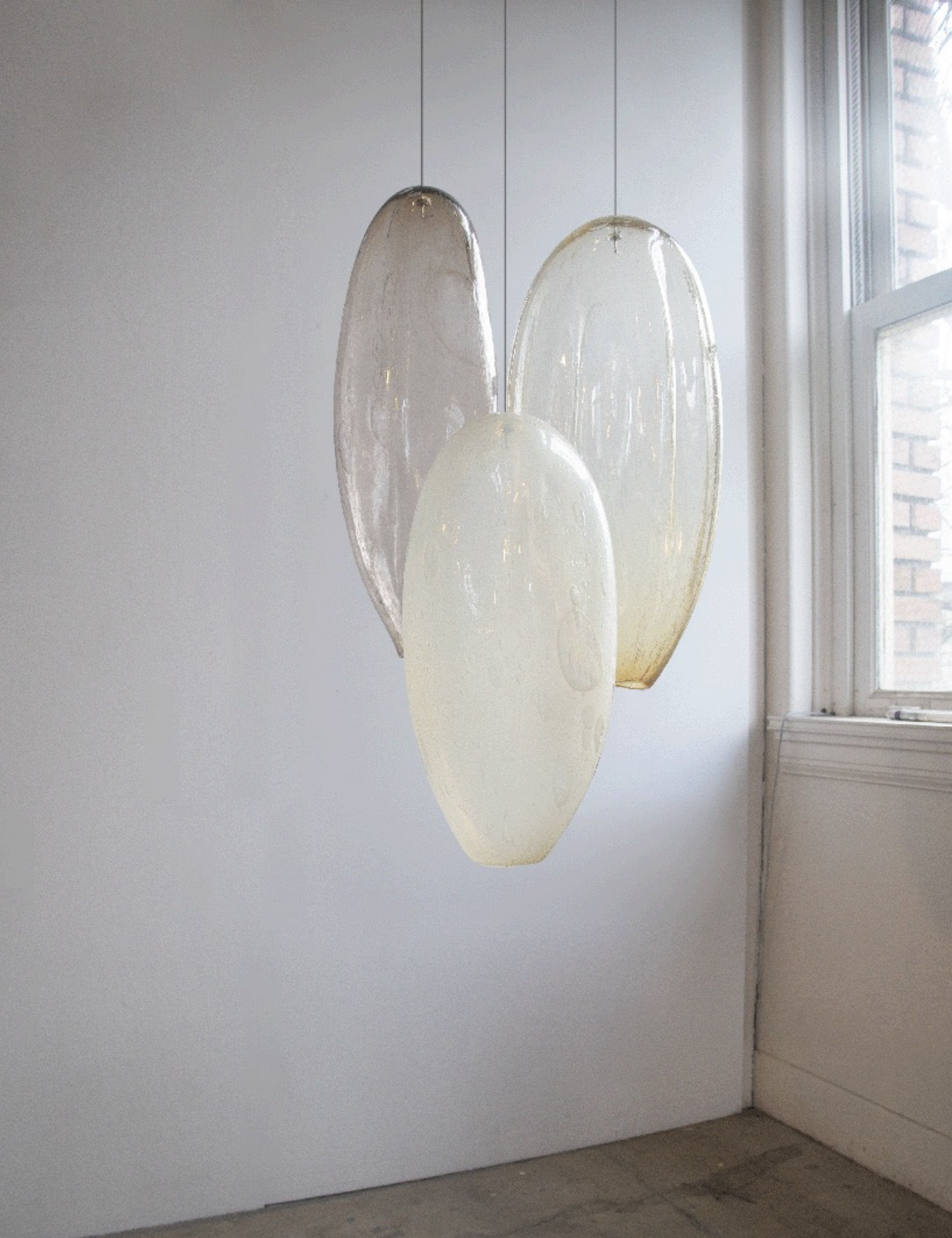
Ann Gardner, Trio C , 2026, Blown glass, 41 x 20 x 25 inches, $23000