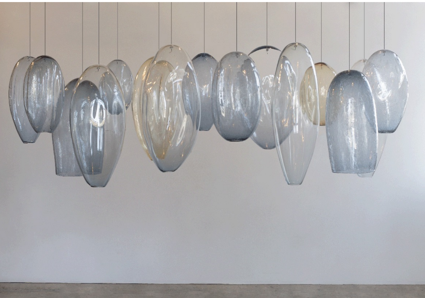
Ann Gardner, Blue Wave, 2026, Blown glass, 30 x 82 x 36 inches, $64000