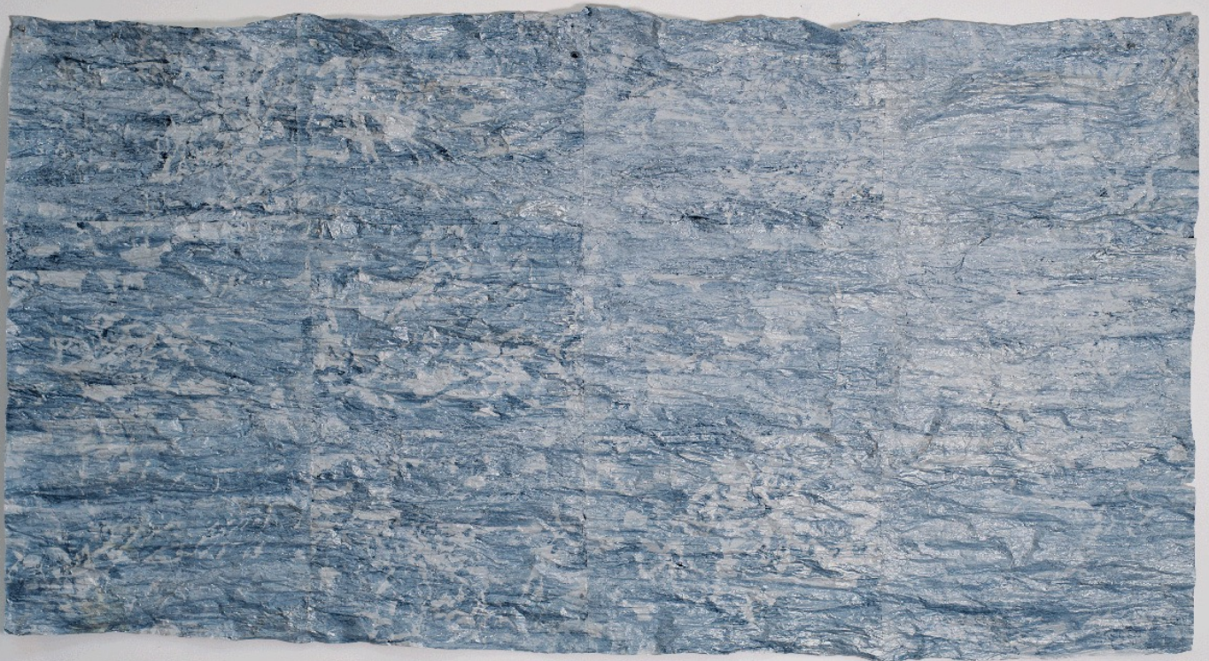
Ann Gardner, Water 3 , 2026, Mixed media, 27.5 x 51.5 inches, $12000