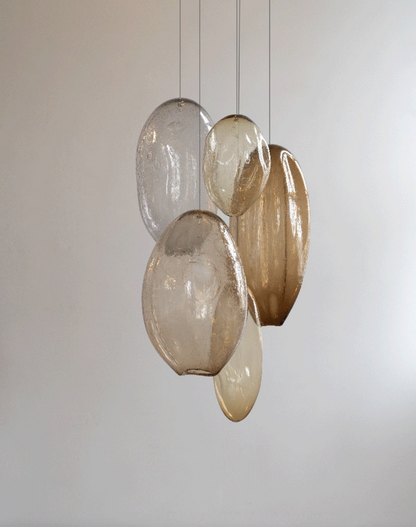
Ann Gardner, Trio I, 2026, Blown glass, 43 x 23 x 28 inches, $32000