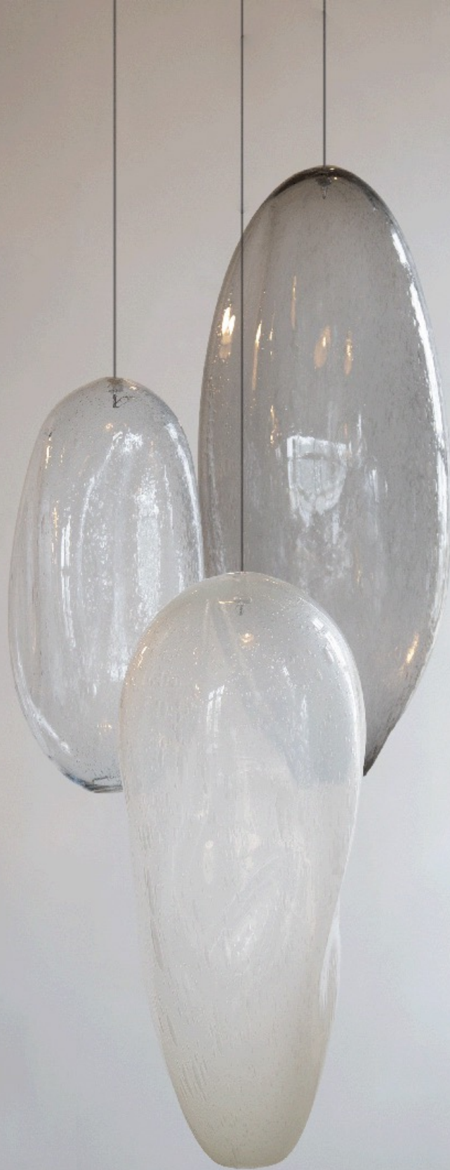
Ann Gardner, Trio D, 2026, Blown glass, 48 x 19 x 22 inches, $23000