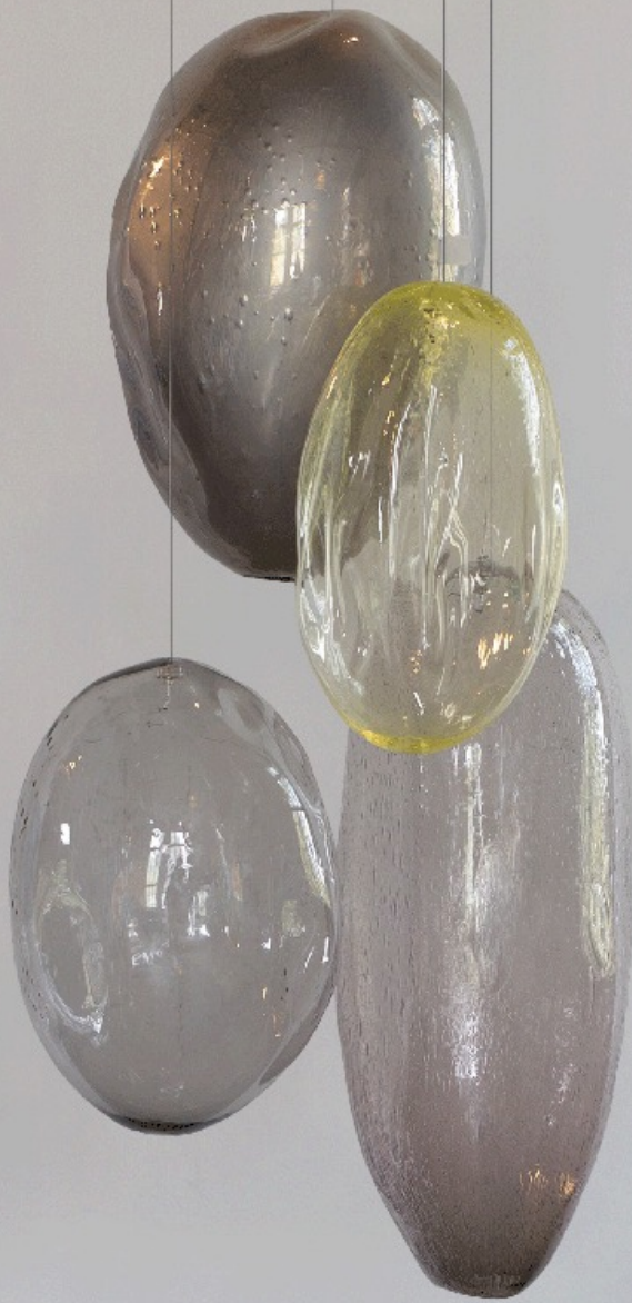
Ann Gardner, Trio F, 2026, Blown glass, 39 x 17 x 19 inches, $28000