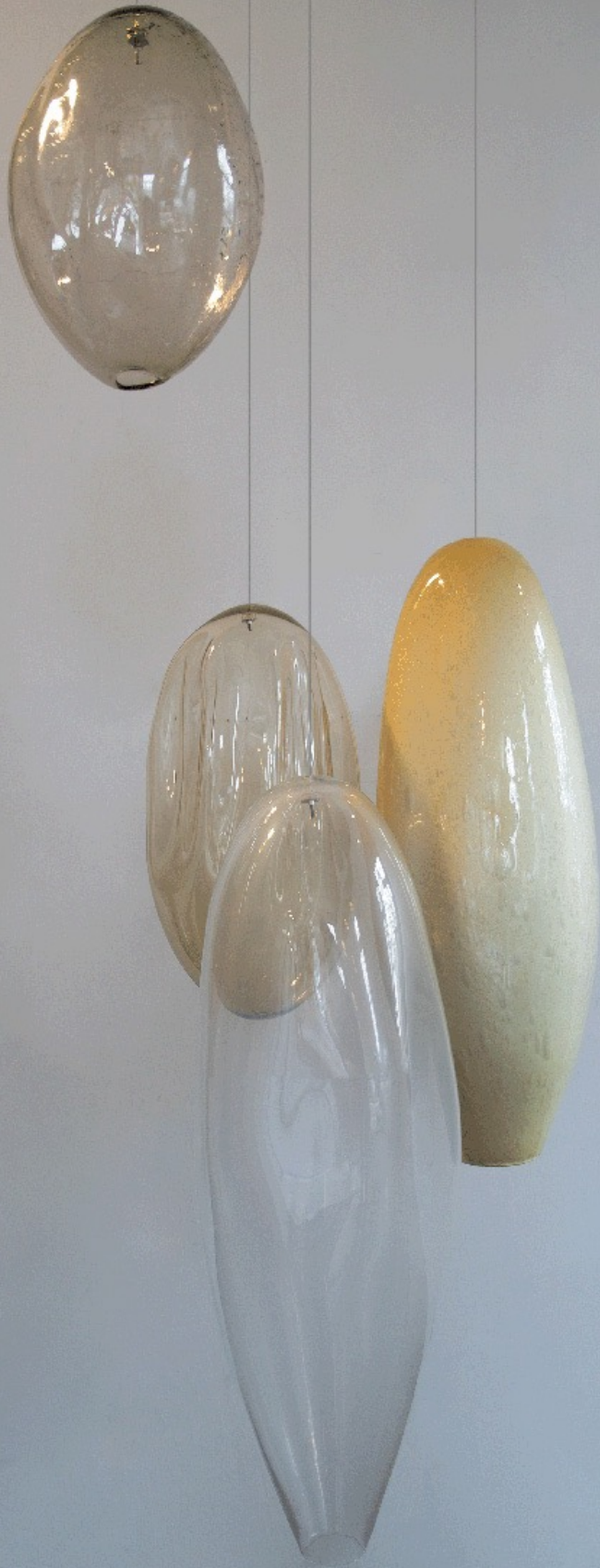
Ann Gardner, Trio A, 2026, Blown glass, 58 x 24 x 22 inches, $28000