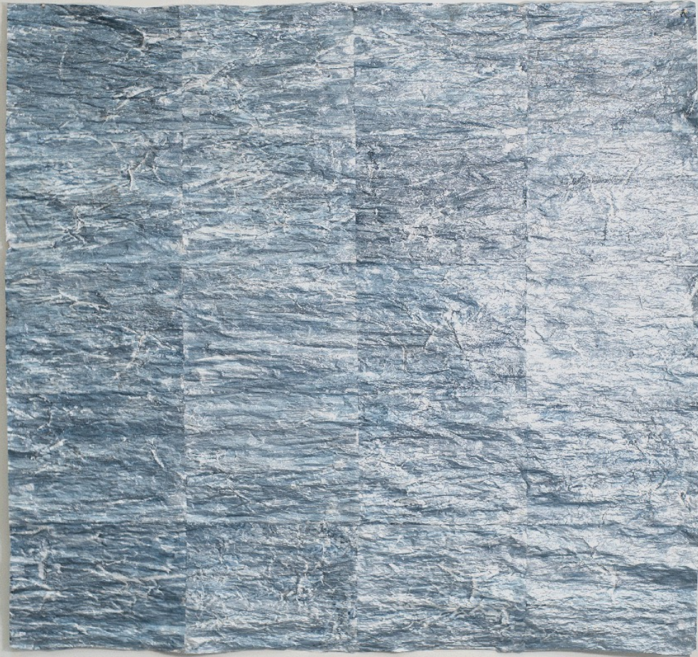
Ann Gardner, Water 1, 2026, Mixed media, 50 x 50 inches, $17000