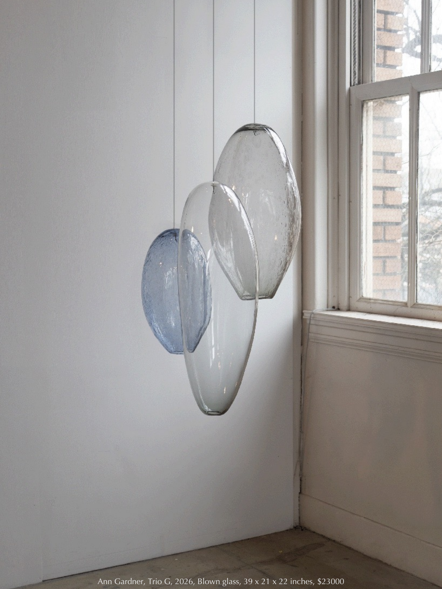
Ann Gardner, Trio G, 2026, Blown glass, 39 x 21 x 22 inches, $23000