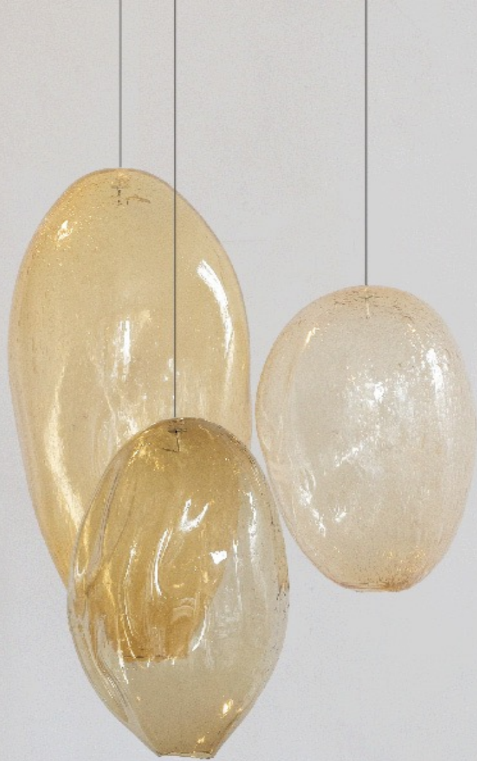
Ann Gardner, Trio E, 2026, Blown glass, 28 x 18 x 18 inches, $23000