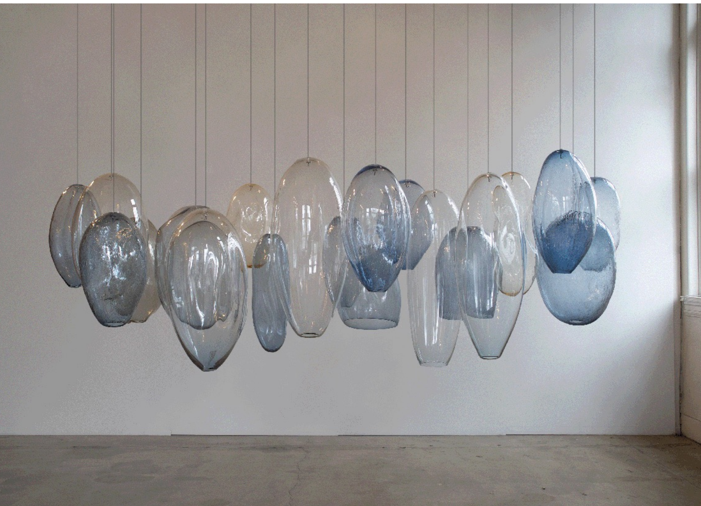
Ann Gardner, Blue Wave 2, 2026, Blown glass, 36 x 106 x 46 inches, $78000